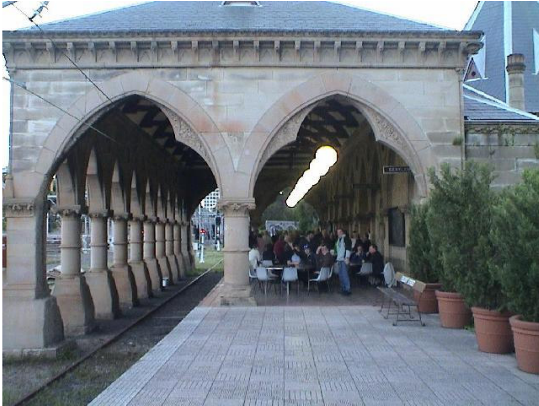
The 50 th Anniversary Dinner gets underway at Mortuary Station

At 5pm on Saturday, October 28, buses arrived at the Clubrooms to take us into Mortuary (Regent Street) Station for our 50 th Anniversary Dinner. While the weather could have been a bit warmer, a good night was had by all.