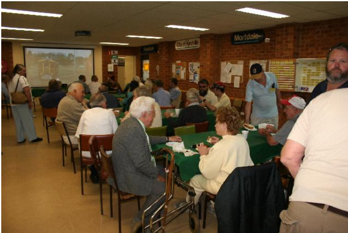
The Downstairs meeting area at lunch time with the AMRA theatre in action.