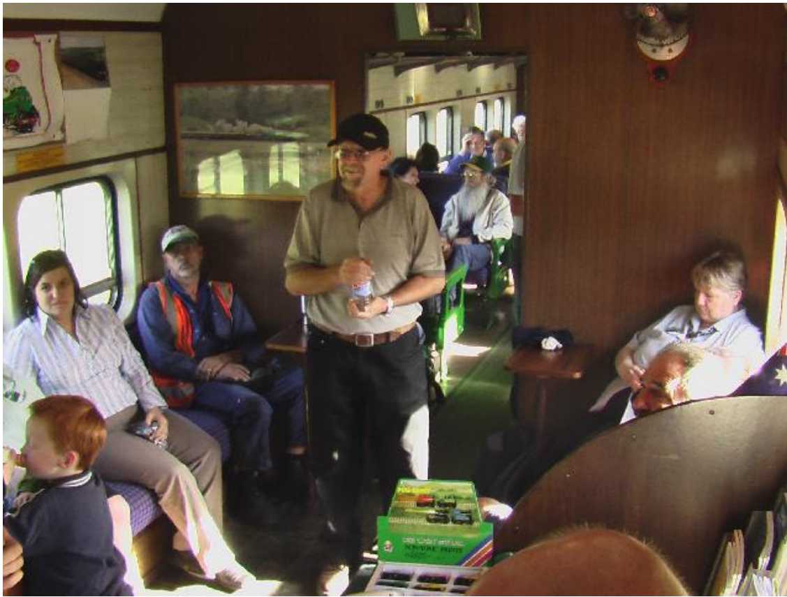
Even more interior shots as we get further along the train