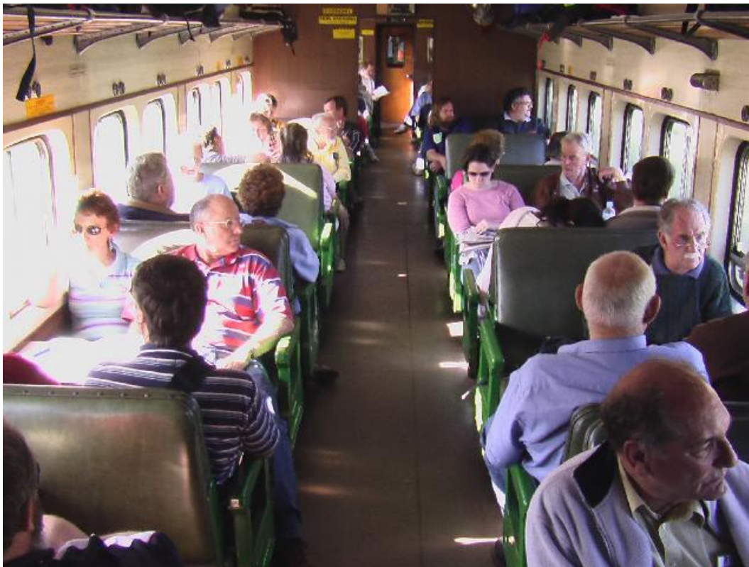
The First of Glenn Percival's carriage interior shots