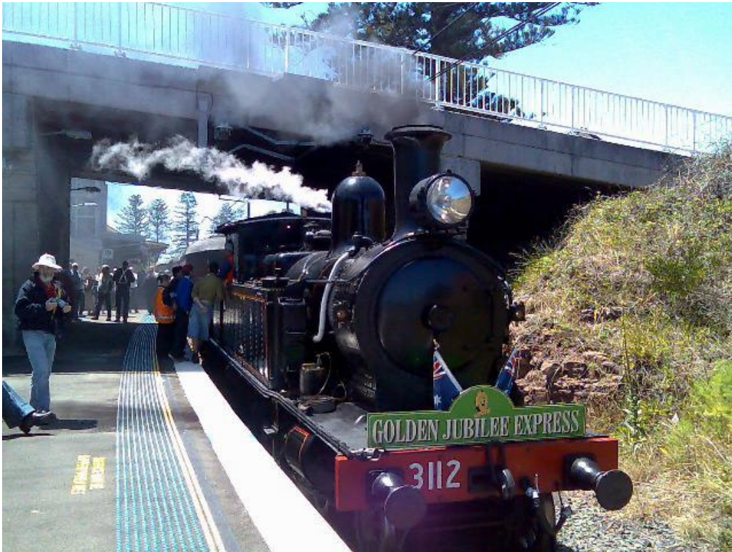
The Golden Jubilee Express at Kiama Station.