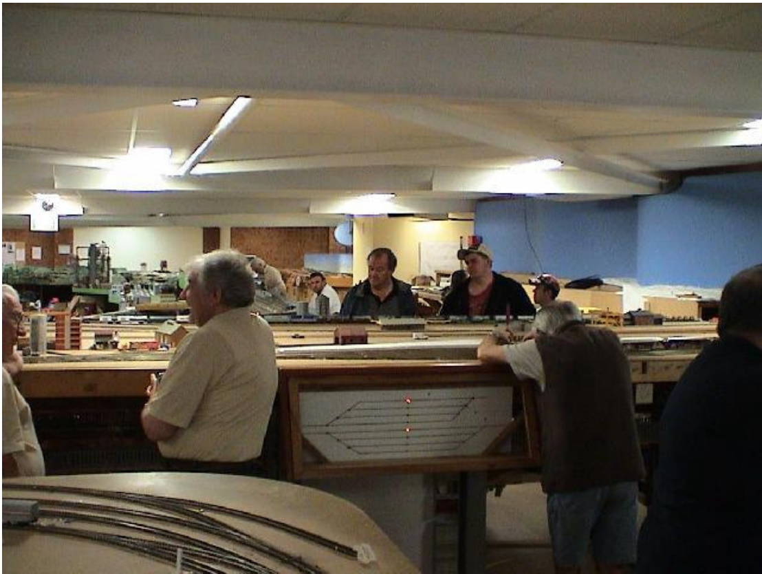
Operations are in full swing on all of the fixed layouts Upstairs