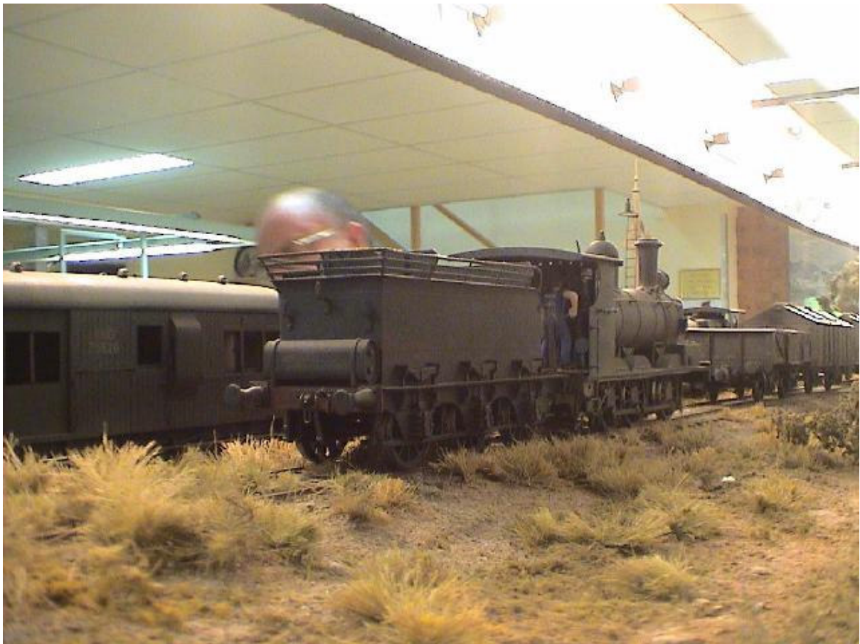
A 19 class is shunts amongst the weeds on Binnabri