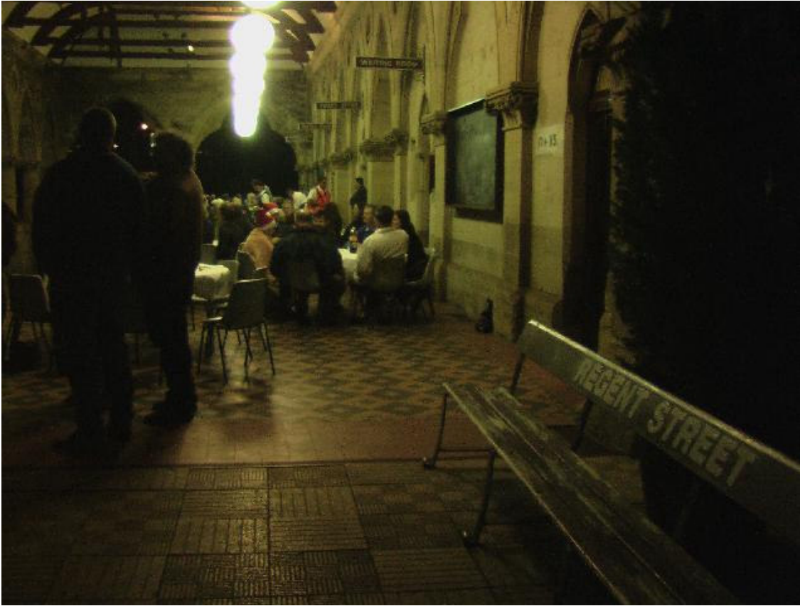
An atmospheric view of Mortuary station at night.