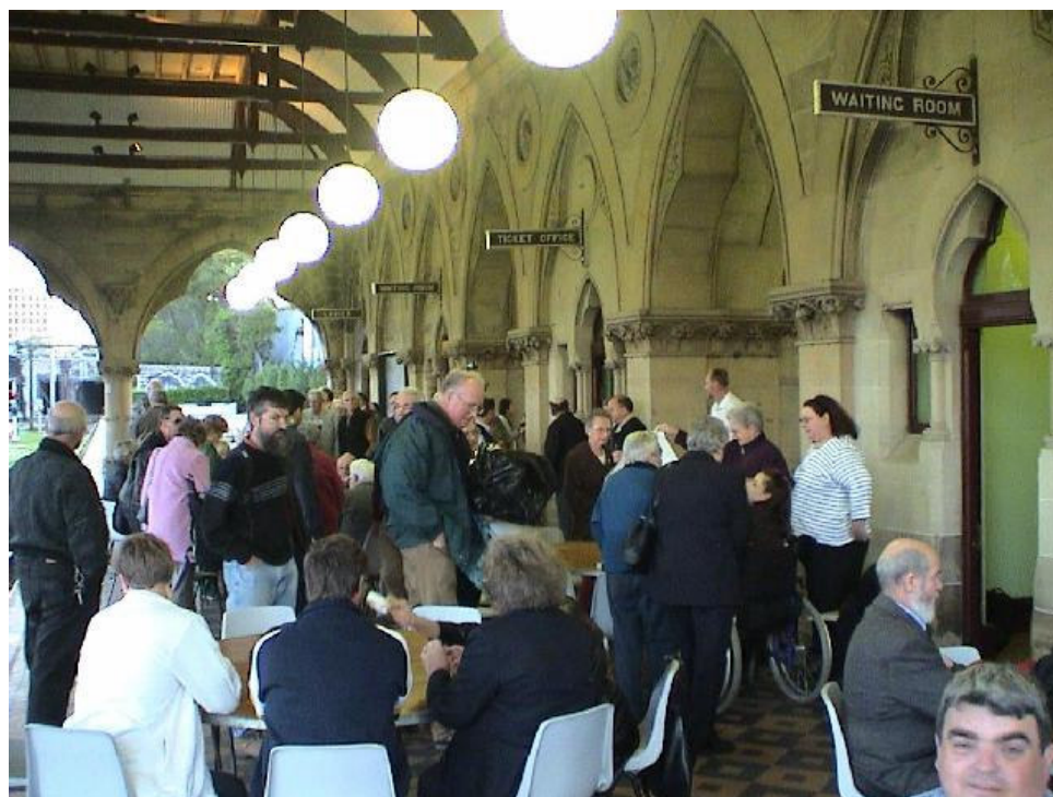
An overall view of the Mortuary Station platform and the seating arrangements as guests arrive.