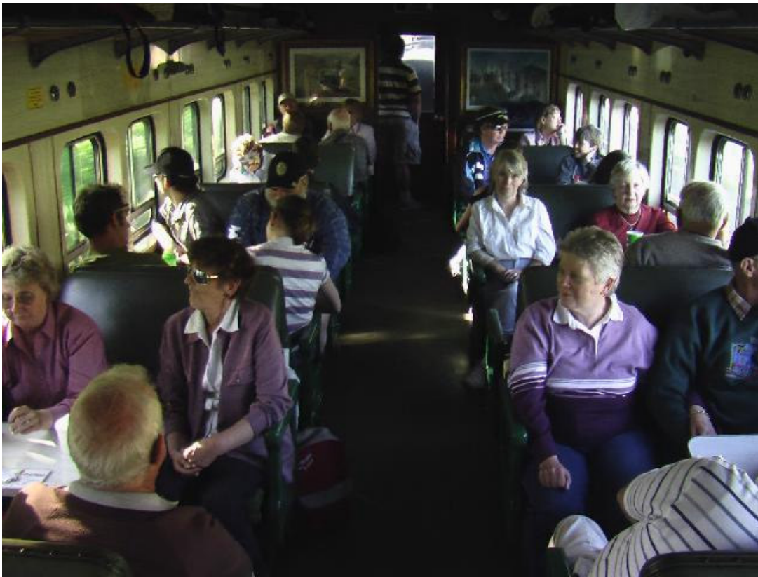
Finally up the other end of the train and the last of Glenn Percival's interior photos.