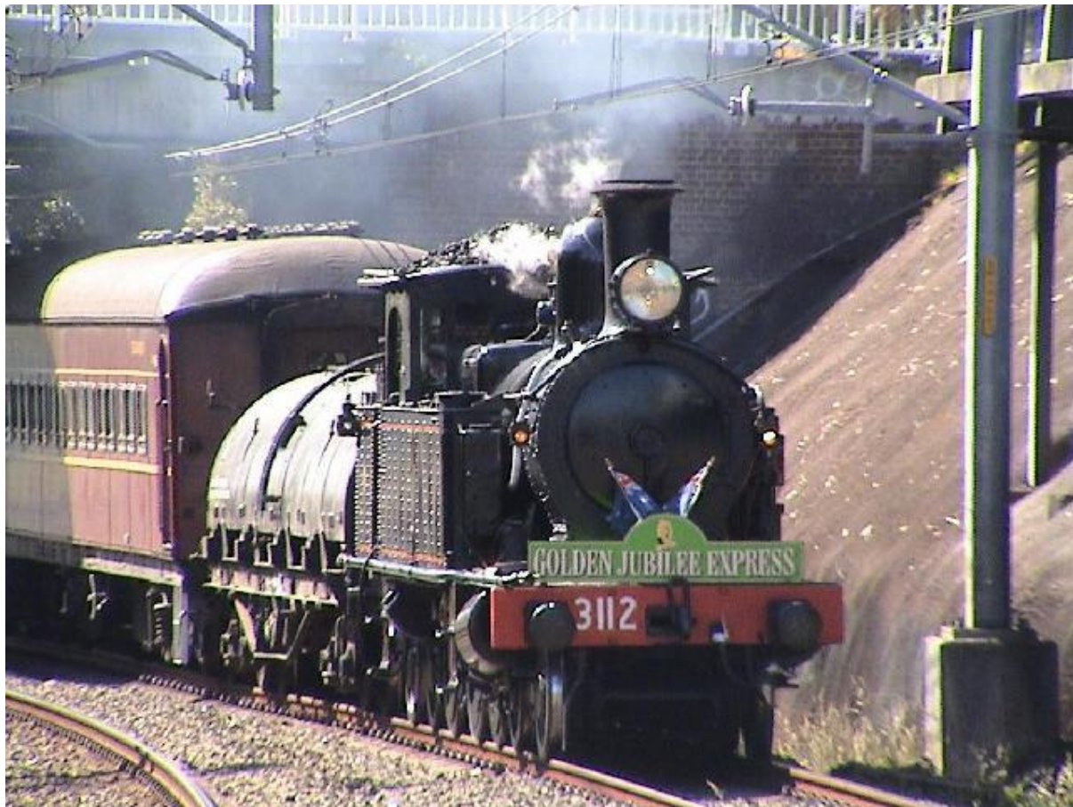
The Golden Jubilee Express approaches Hurstville Station – Oct 29 2006.