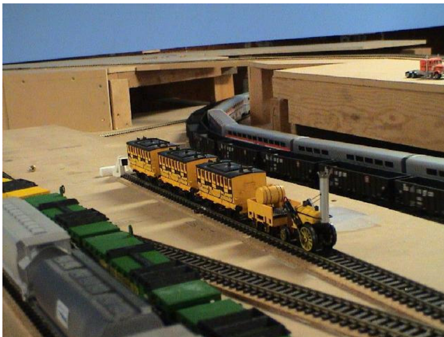
A vintage Tri-ang Stephenson's Rocket operated briefly on the HO layout before disgracing itself and being retired to Peel Ridge Yard

The Golden Jubilee weekend began with facility fee free general activities at the Clubrooms on Friday night, October 27 th and Saturday, October 28 th . All of the fixed layouts were operating, as well as Moss Vale and Binnabri . The weekend also marked the debut of the AMRA NSW theatre in the main meeting room. A continuous selection of rail related DVD's was played on the big screen.