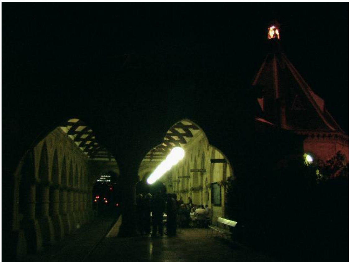
Mortuary Station towards the end of the evening.