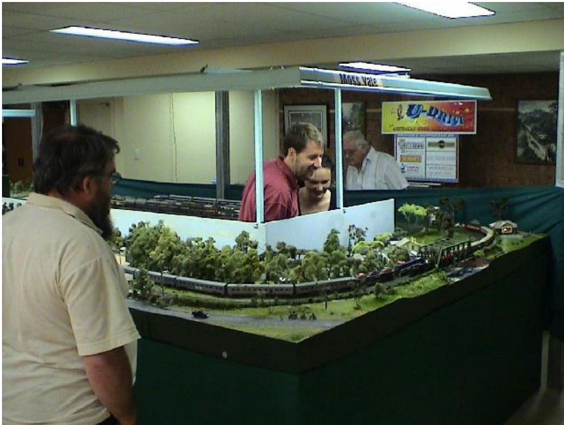
Moss Vale in action