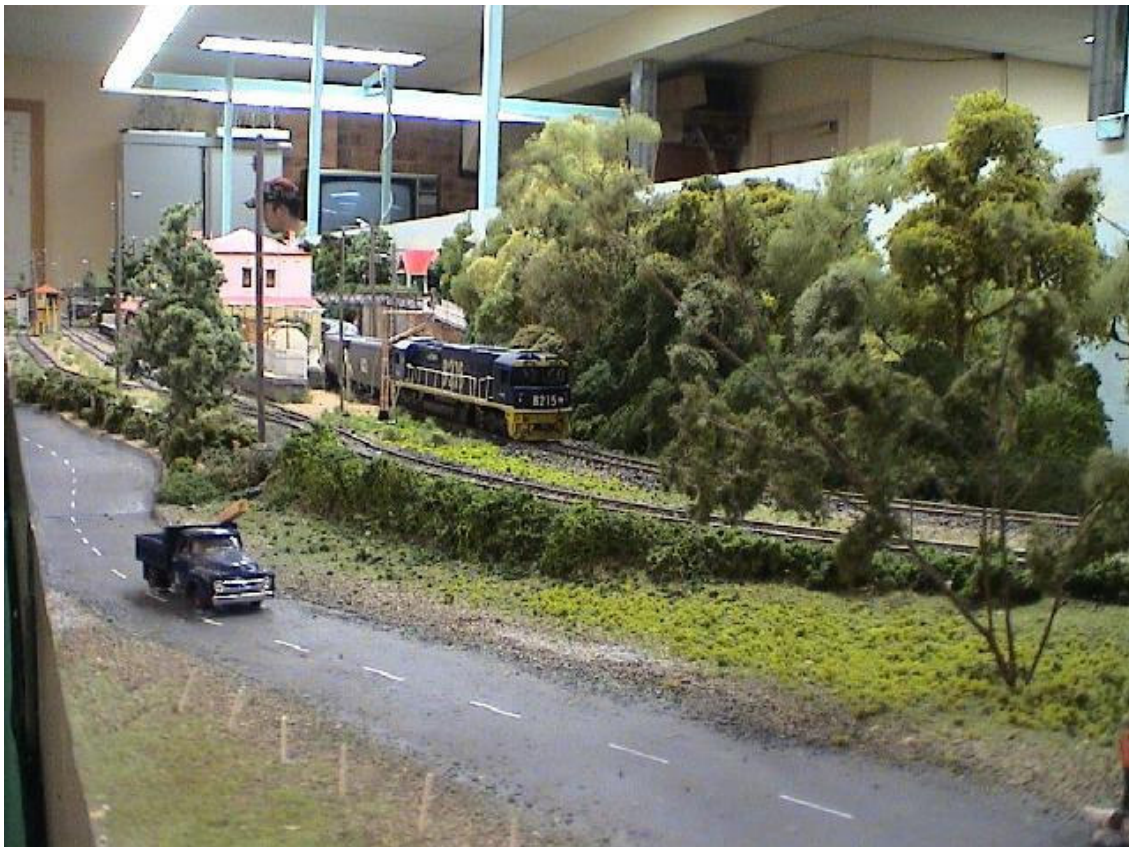
An 82 class takes a wheat train through Moss Vale's down platform