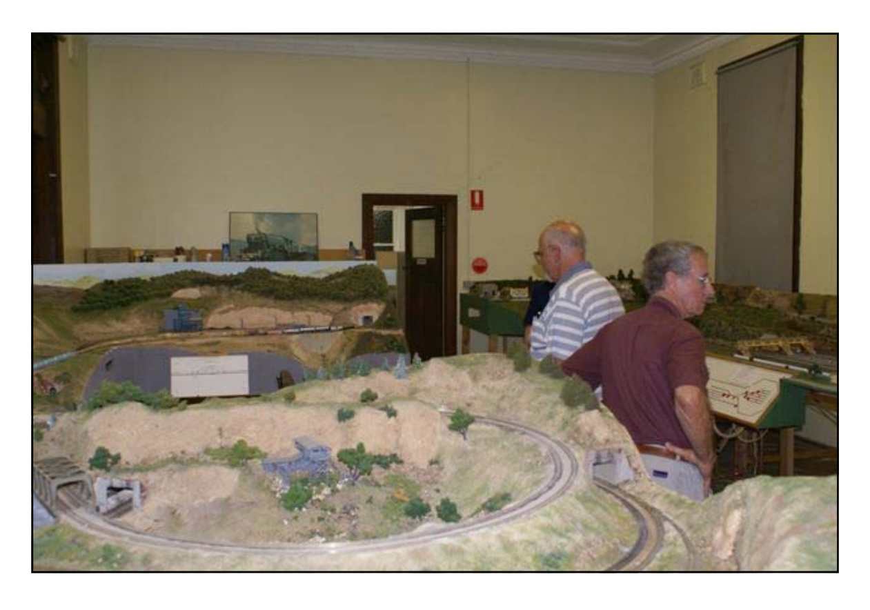
The N scale layout at the Hills Model Railway Society at Baulkham Hills during the recent AMRA NSW visit. February 23, 2007.