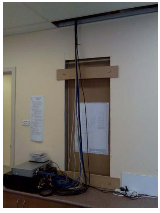
The cutout has been created in the office wall for the permanent installation of the Audio / Visual equipment. A cabinet zaccessible from both sides of the wall will be installed in this hole.

Check the programme on page 10 for more details.