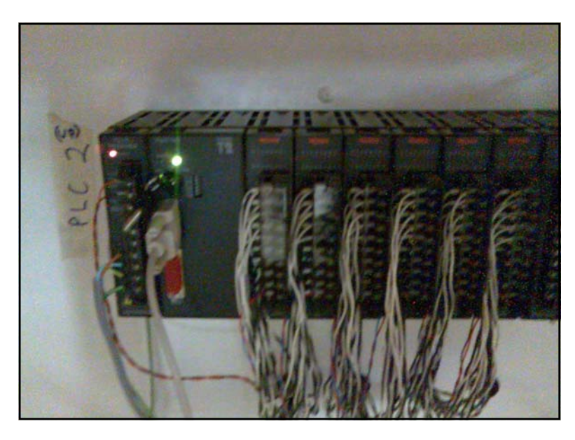
Look at the pretty lights! The Stoney Creek Down PLC takes control of the mainline for the first time. February 4, 2007.

The work days on Stoney Creek have moved along so well that it is interesting to keep the planning work and material up to the ever growing work force that comes along on the 1st Sunday of each month.