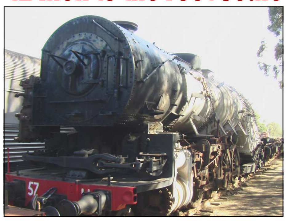
The once mighty 3-cylinder 5711 waits up at the southern end of the RTM part way through a static restoration. Much of the locomotive is overshadowed by its massive boiler and smokebox. February 17, 2007.