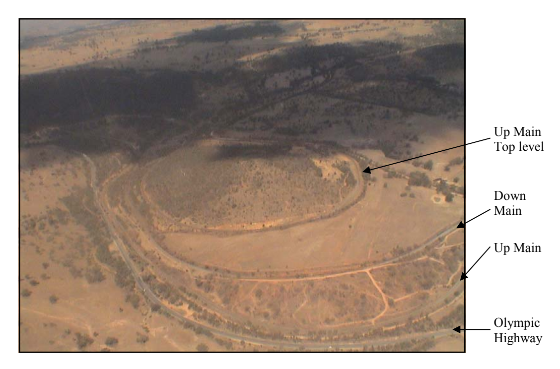
Bethungra Spiral on the Main South between Cootamundra and Junee seen from 3500ft. Taken from the Southwest looking North East. February 18, 2007.