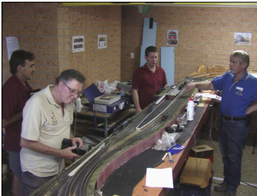
AMRA NSW members recently visited the Canberra Model Railway Club at Lyneham in the A.C.T. Here several of our members operate their HO layout.