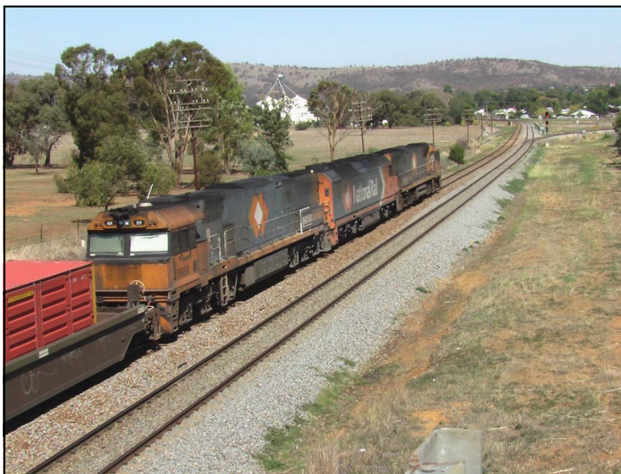
Further along the Main South, Down Pacific National train 5BM2 speeds into Cootamundra behind an NR + DL + NR combination. Cootamundra North Junction, which leads to Stockinbingal and then Temora, Griffith or Parkes is just ahead of the train to the right. March 23, 2007.