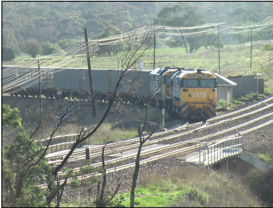
The rarely photographed location of Joppa Junction. 8179 leads a 48 class and a second 81 on train 2122, the empty rubbish train. The train is leaving the Canberra line and rejoining the main south. On the other side of the bridge the train will cross over to the Up main. March 22, 2007.