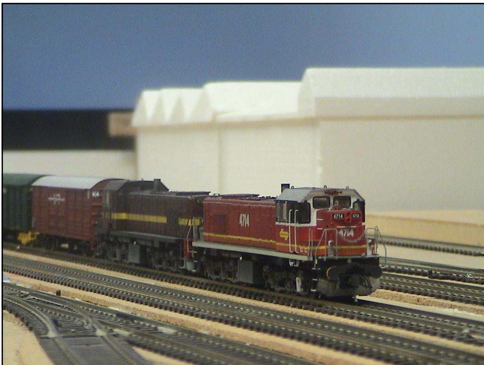
A pair of grubby 47 class locos speed through Read. This area will soon be redeveloped to make the area more suitable for this type of train. March 11, 2007.