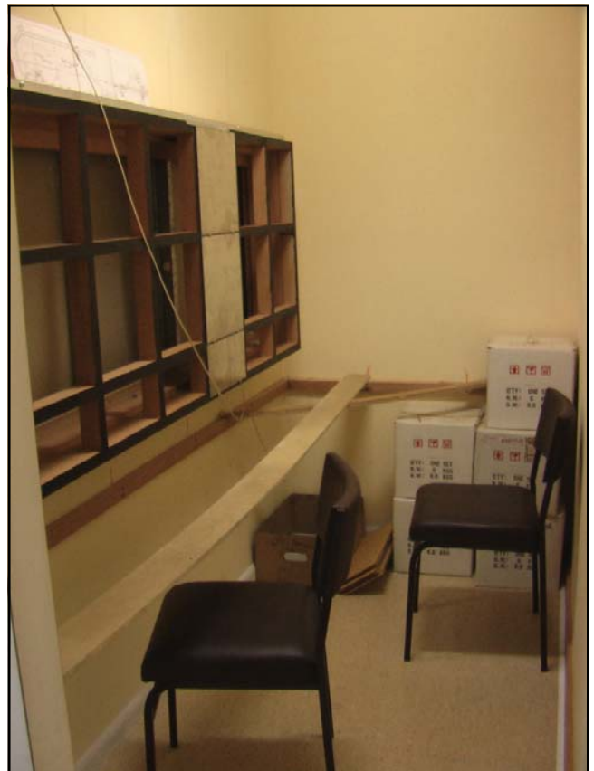
The newly installed CTC panel for Stony Creek. A desk will be installed where the timber has been placed. March 24, 2007.