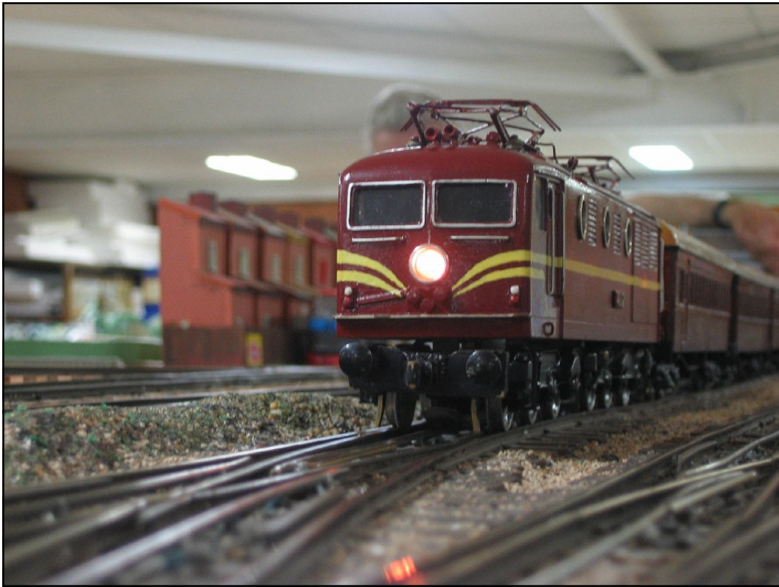
Col Shepherd's 46 class blasts through the crossovers at Central station as it departs for another trip around the O scale layout. 28 November, 2007.

Firstly, some comments directed at those members who get the chance to read "Mortdale Matters" but do not make it to the Club very often. You will hopefully be interested in why the stately, venerable gentlemen that hang around the "O" layout are adding more track.