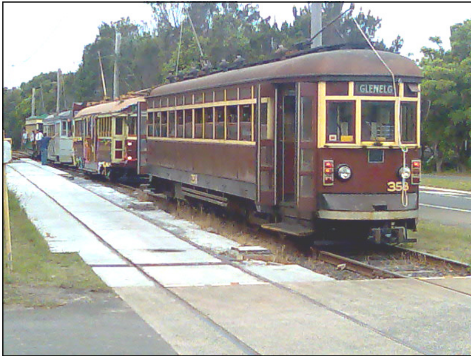
Adelaide H class tram 358, heads a line up of trams from around Australia at the Sydney Tramway Museum at Loftus. December 1, 2007.