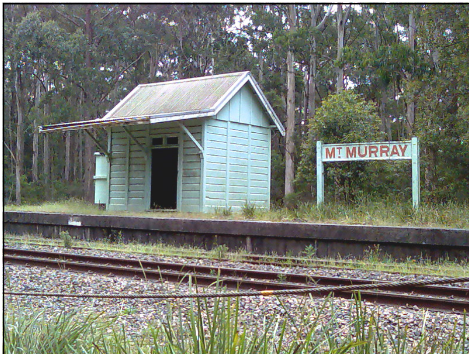
The Prefabricated station building at the crossing loop of Mt Murray, near Robertson, on the cross country line between Unanderra and Moss Vale. It is still possible to reach Mt Murray by road, but access to the platform is now gated off. November 29, 2007.

On the back cover: Sydney R class tram 1979 rests at Loftus in the early evening after returning from a run the Royal National Park. 1 December, 2007.