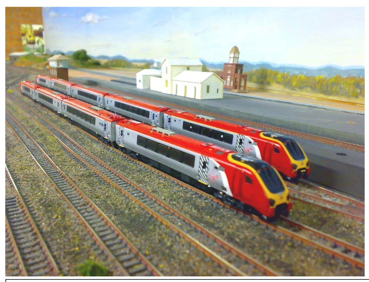
All three permanent layouts saw action overnight during the 24-hour running sessions. Shown here is the N gauge layout getting into the spirit of the UK session, with Wallamudra Yard acting as the Class 221 Super Voyager DMU running yard.

The tracks to the roundhouse have been lifted and re-laid to align with the turntable. On the Open Weekend we had two small cameras going around the layout mounted on wagons, these showed us that we need to scenic the inside of our tunnels. Ash Garrard has painted black the inside of the loop near Wallamudra when the camera ran around again it revealed other areas that needed blackening. We are planning to install some tunnel lighting using fibre optics. Steve Edwards has been touching up the buffer stops to highlight some parts. A faster computer has been obtained to run the slide show that depicts the reconstruction of the layout after the move from Rockdale and subsequent progress on the layout.