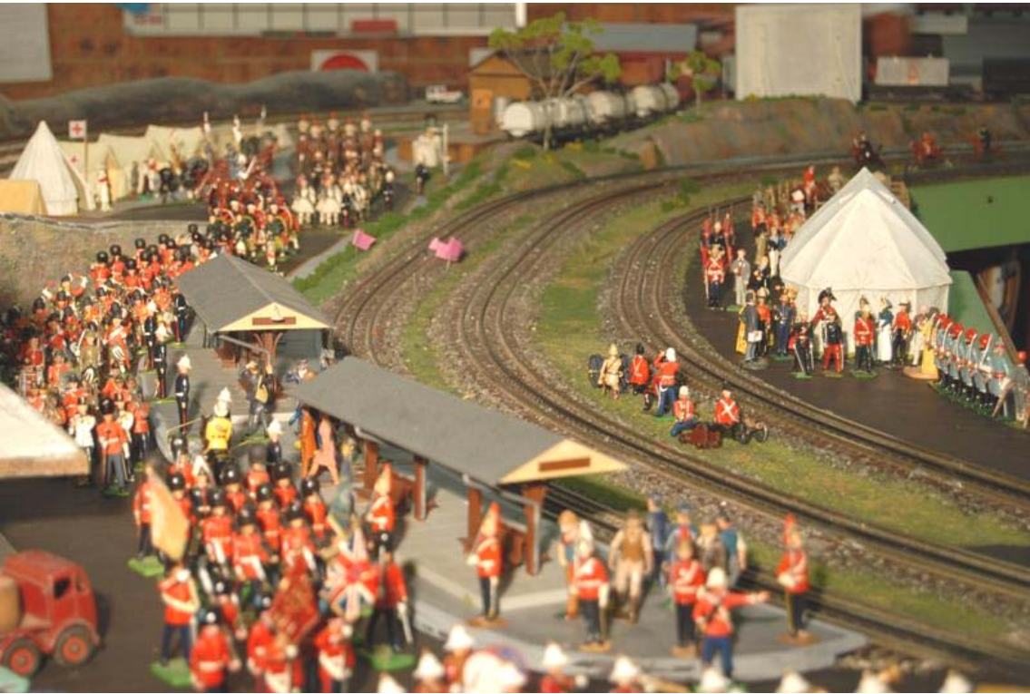
Some of the crowd on hand at the opening of the O scale extension