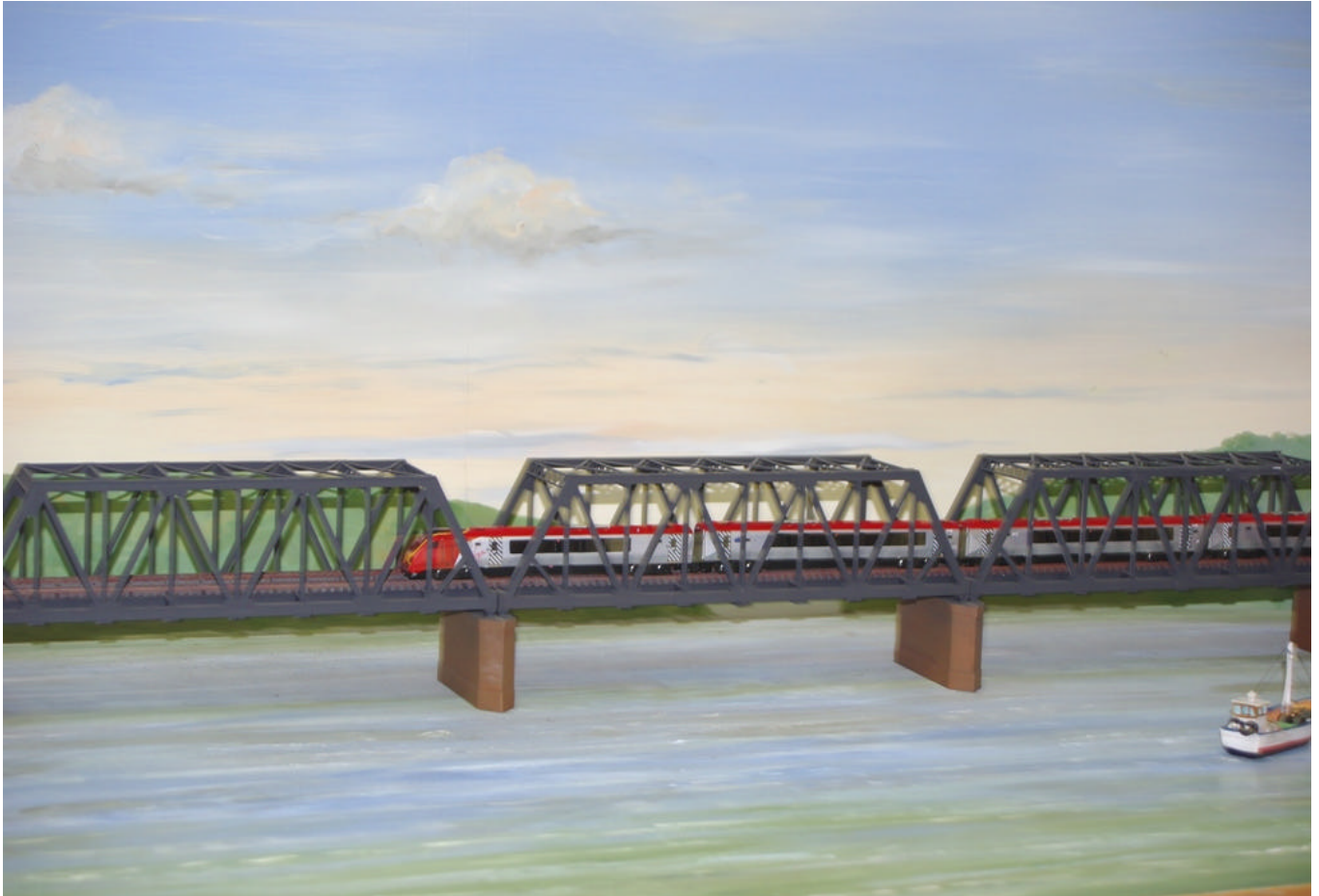
Class 221 Super Voyager DMU crossing the bridge on the clubs N Scale Layout. This photo showcases the excellent contribution made by Val Bennett in painting both the river and the backscenes. The bridge was assembled from three Walthers kits.

David Bennett reports that regular maintenance is ongoing with a set of points being re-soldered in Watson Flats recently. More buffer stops are being made to finish off the area around the roundhouse at Wallamudra. Work is well advance for the construction of the sawmill located at Lischeld siding, this is being made mainly of 0.4mm and 0.8mm plywood. Fluorescent lighting is being developed for the main tunnel near Wallamudra engine depot, this is being done using 1.5mm optic fibre and four superbright LEDs