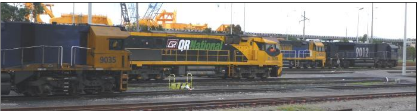
ABOVE: 9035, 5010 and a 92 class with 9012 all lined up for duties at Port Waratah.