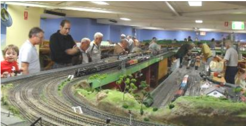
ABOVE: A view of the crowd observing the O gauge layout.