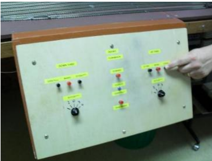
ABOVE: Glenn Percival demonstrating how to use the temporary control panel at Deawy on AMRA's HO layout..

The Up Yard and turnback at Deawy are now operating for the storage of trains. This is a temporary arrangement; NO shunting until the full-featured control system comes on line. On the positive side there is a soft start/stop when entering or exiting either yard. The turnback has the same feature, and as a bonus we now have a station stop at Deawy.