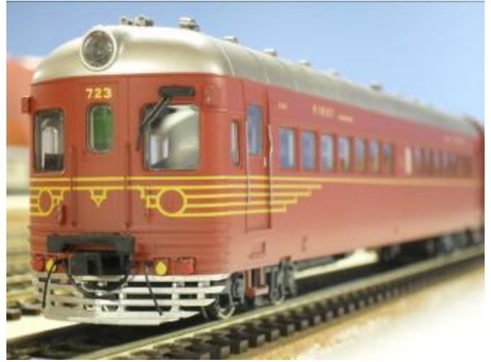
ABOVE: 623/723 stands in Fayenton yard on AMRA's HO layout.