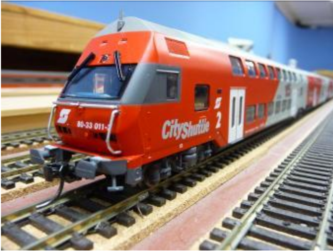
ABOVE: An Austrian weasel double deck push and pull stands on AMRA's HO layout during Electric Traction night.