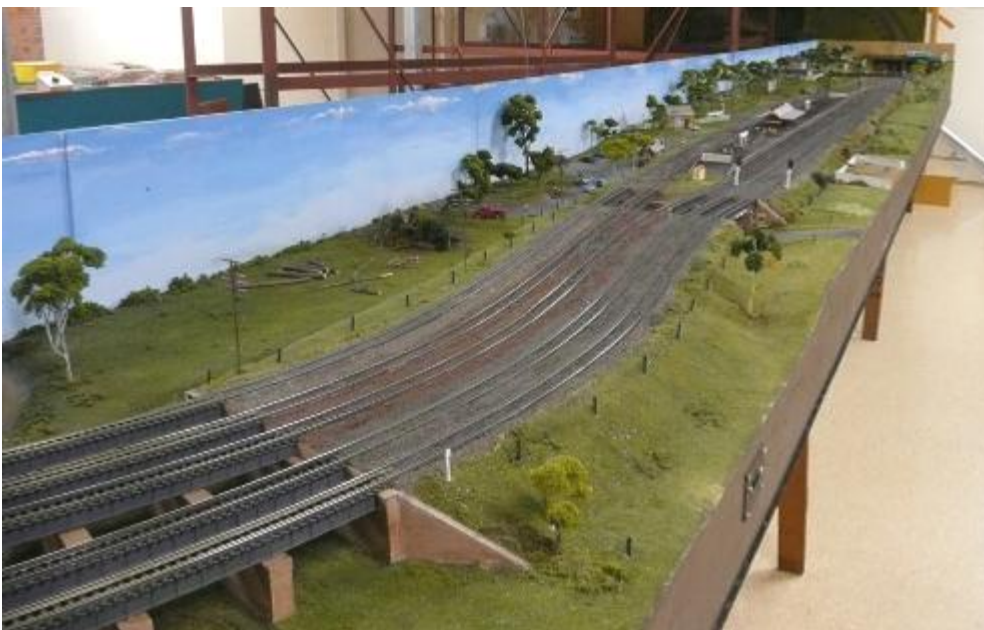
LEFT: East Matelend set up for a trial run.