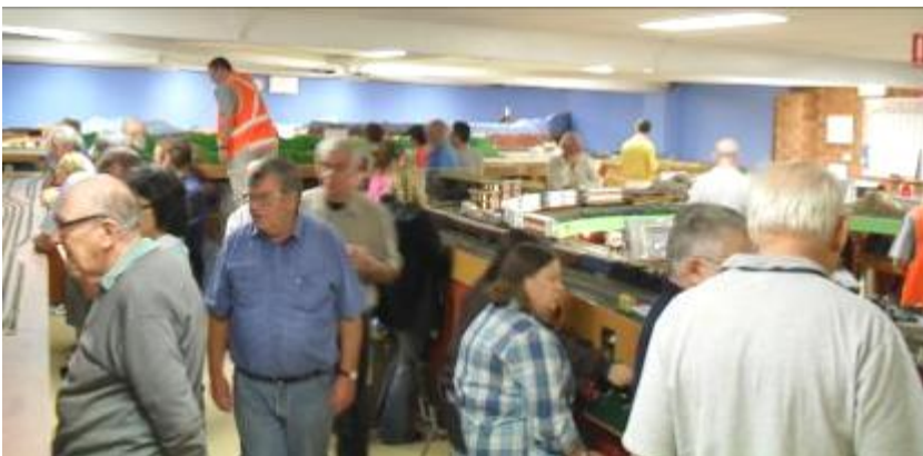
BELOW: A view of the crowd observing the O gauge layout as well as the HO layout.