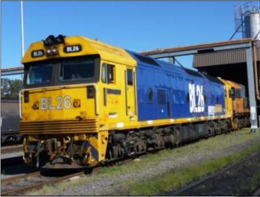
LEFT: BL26 and an NR refilling at Port Waratah.