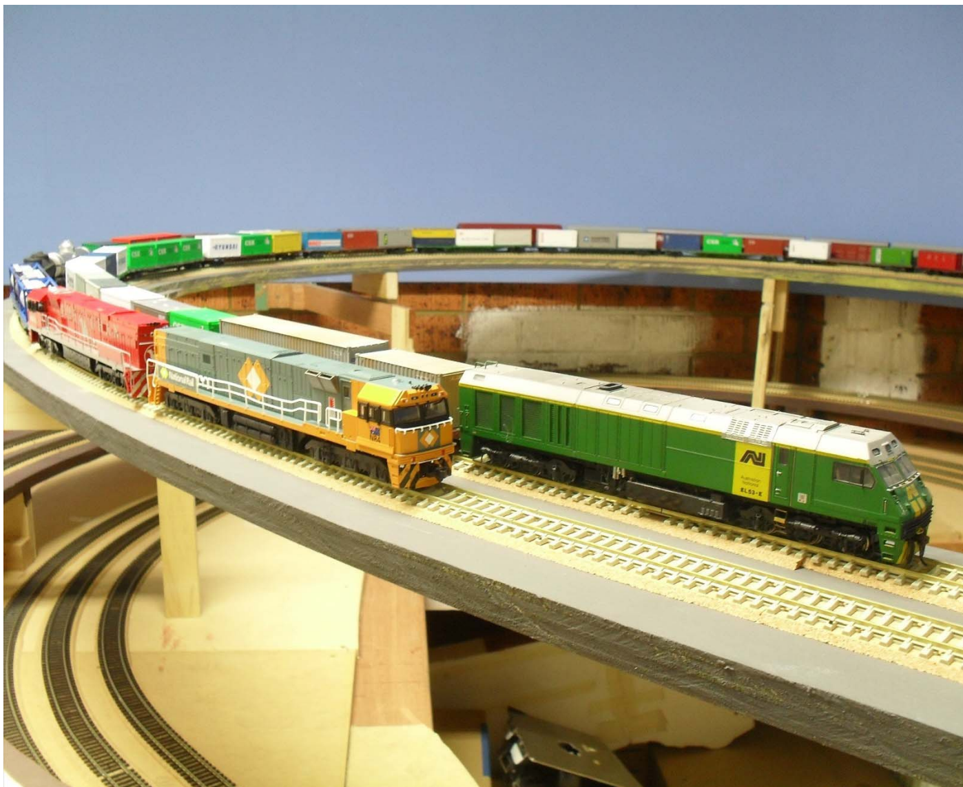
ABOVE: Two freight trains sit in Brewers Creek on the heavy branch line on AMRA NSW's HO layout.