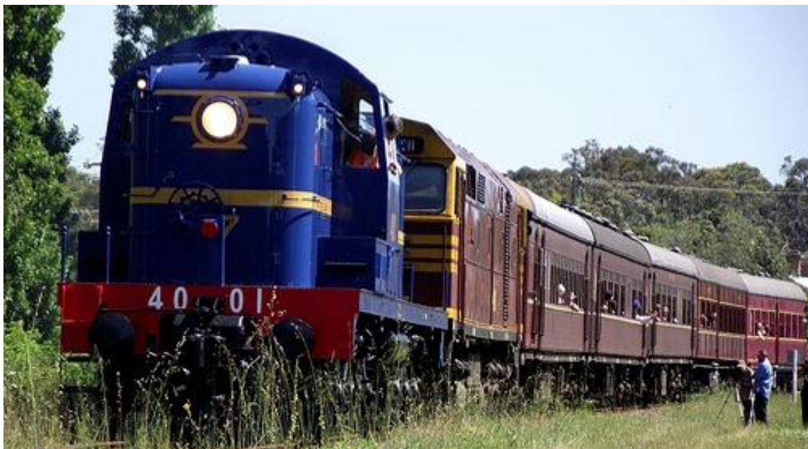
4001 and 44211 depart Thirlmere to Central on the first official run. Photo captured at Thirlmere.