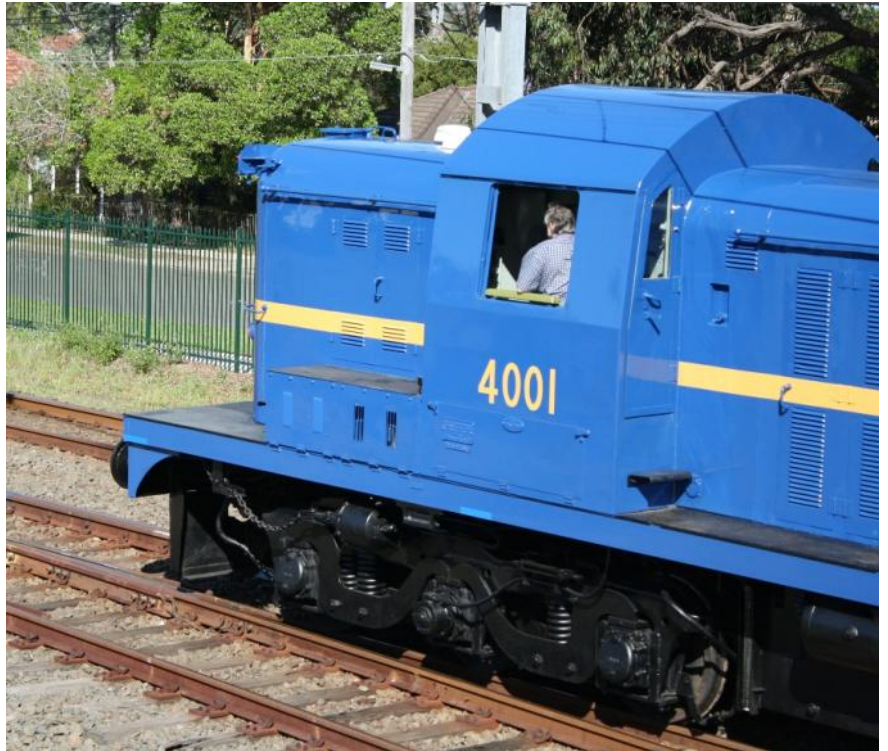
4001 moves slowly through East Hills on its first official run.

The NSWRTM (New South Wales Rail Transport Museum) has spent many years in planning and restoring diesel electric locomotive 4001. The goal was to restore 4001 in operational condition for mainline trips by the RTM. And they did it! With lots of mechanical work and a fresh paint job (royal train blue) it was a success. 4001 had been out of service for around 40 years. 4001 was preserved in non working condition. Test trips by the RTM were successful with assist locos 44211 and 4520. The re-launch ceremony took place on Saturday 12 November 2010 at Thirlmere (NSWRTM's base). 4001 and 44211 led a 5 car passenger train via the East Hills line to Central and return. Well done to all the volunteers at the NSWRTM for restoring 4001.