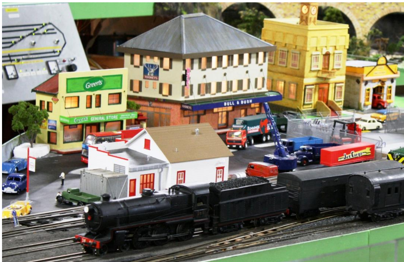
A 36 class stands in the yard on the O scale layout.