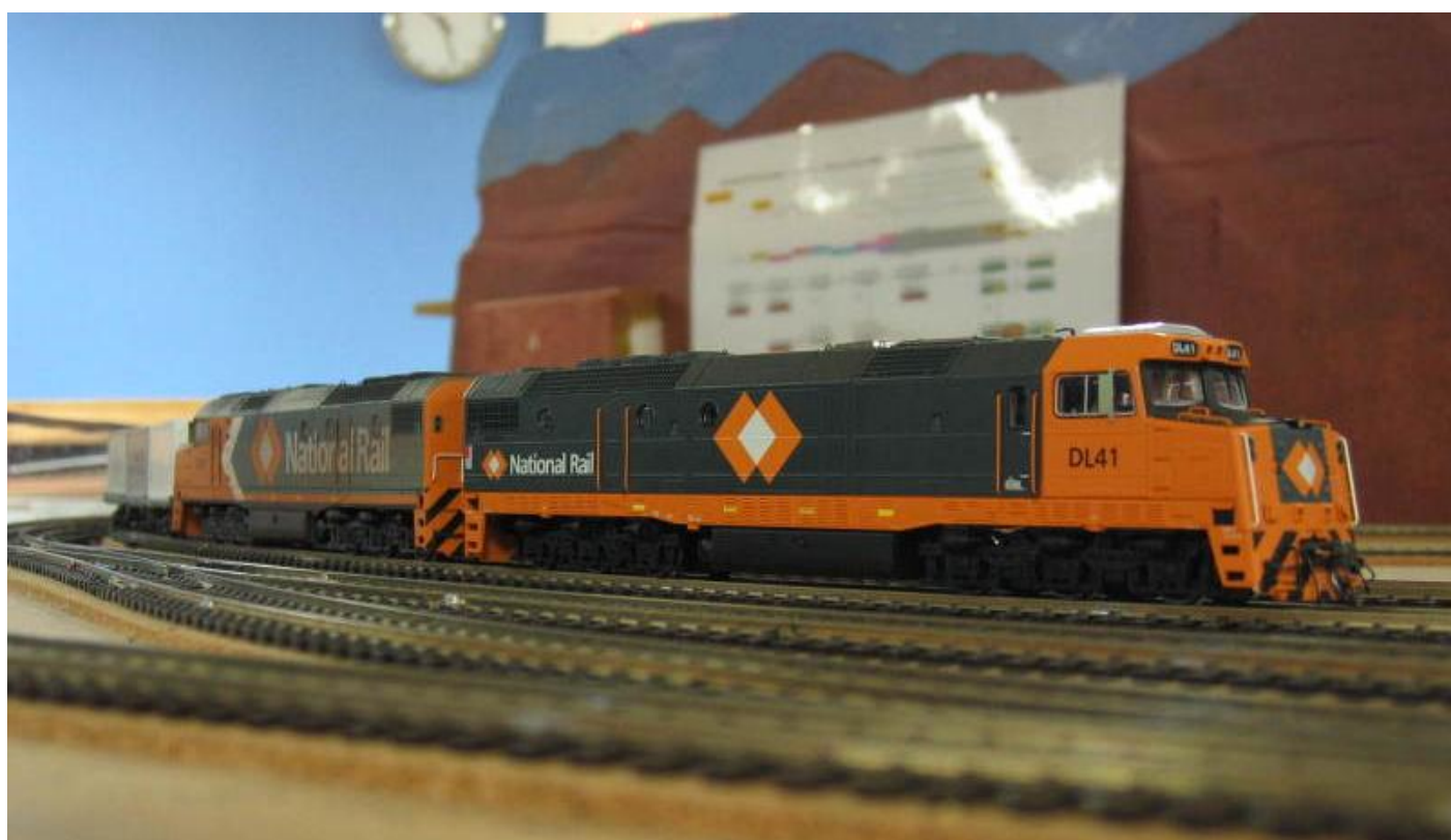
DL41 and DL44 pass through Yerriyong Down Yard with a container train. This photo was taken in 2009. The train is owned by Ben Gilmore.