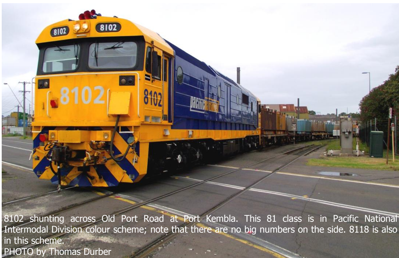
8102 shunting across Old Port Road at Port Kembla. This 81 class is in Pacific National Intermodal Division colour scheme; note that there are no big numbers on the side. 8118 is also in this scheme.