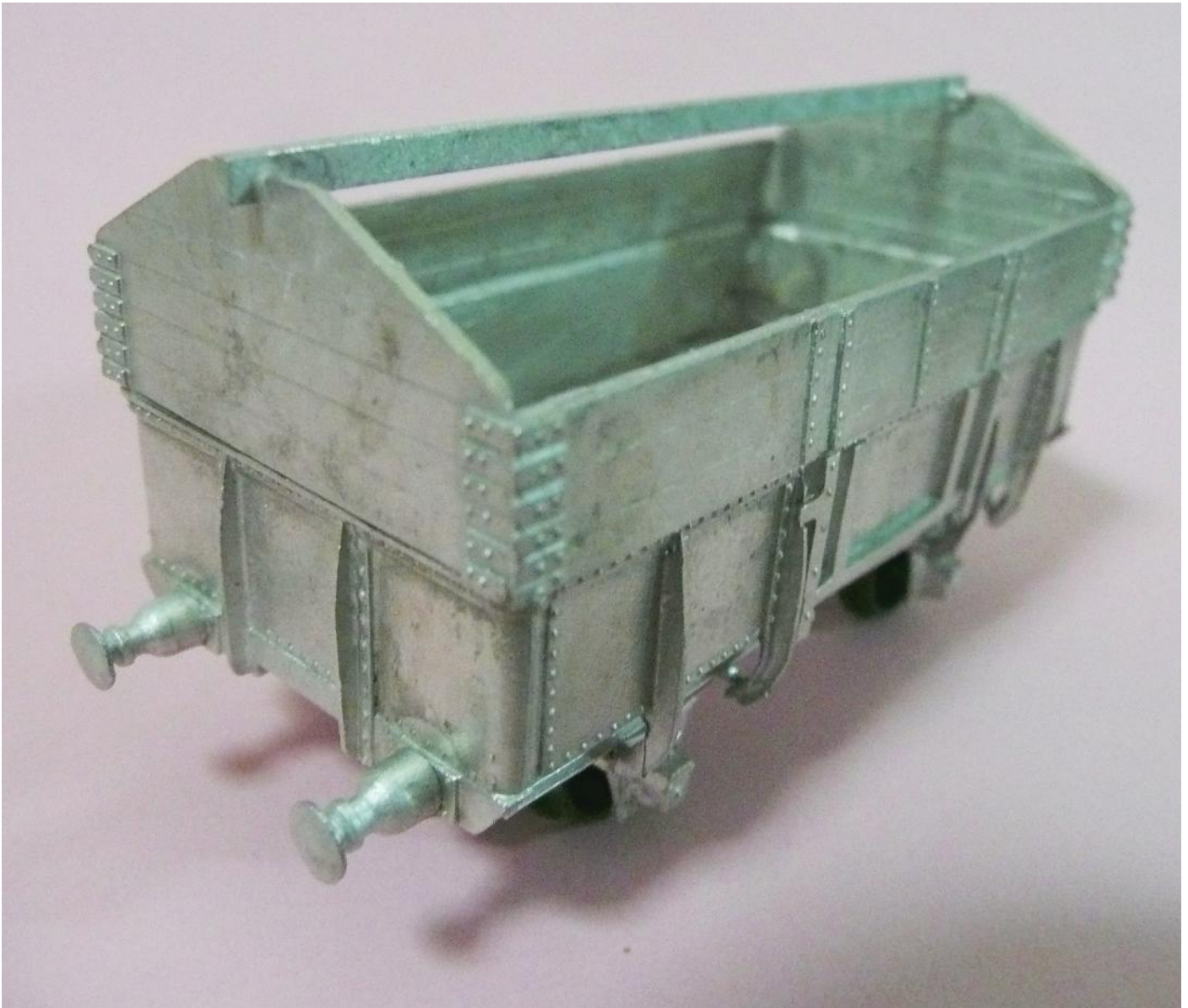
An almost finished kit of the Bergs WS wagon.

This Model Gallery is dedicated to the Whitemetal soldering clinic (Page 10 and 11)