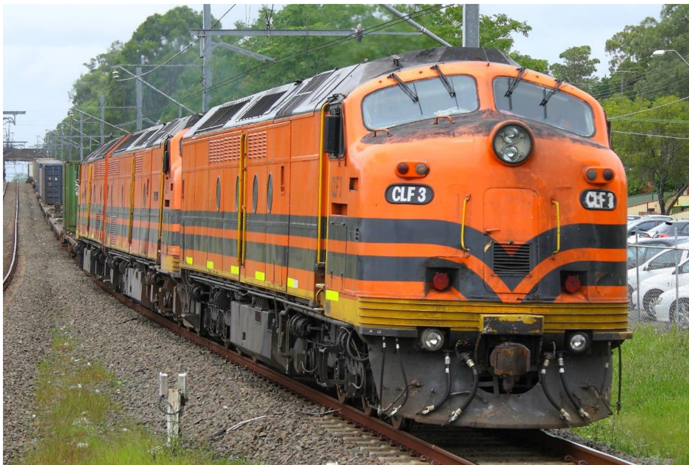
CLF3 powers through Panania with 4MB7. Triple CLP's and CLF's were used on Brisbane to Melbourne and Melbourne to Brisbane intermodal services during January 2011.