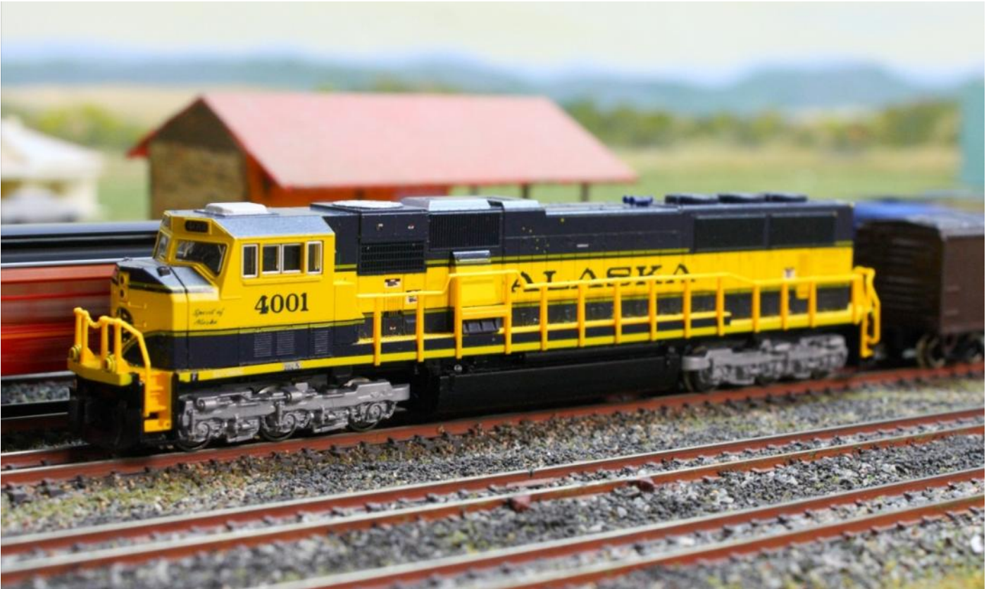
ALASKA's 4001 (not the Australian 40 class) stands in the yard on the N scale layout.