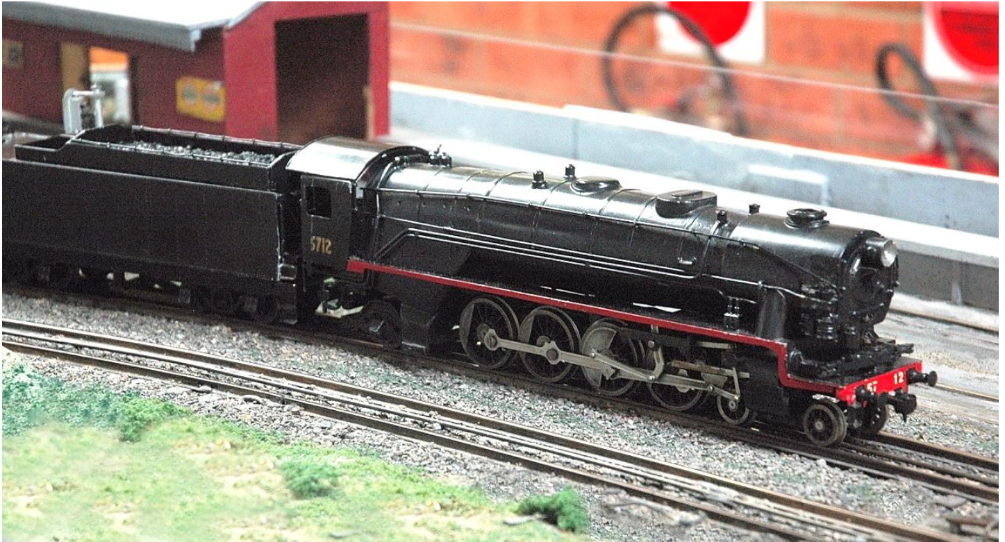
5712, a member of the NSWGR D57 class, stands on the O scale layout