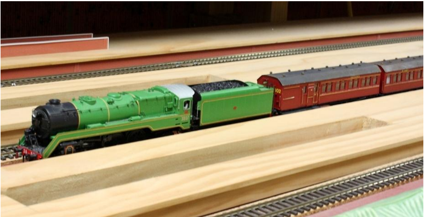
Rod Fussell's NSWGR 38 class stops at Read platform 2 to unload passengers.

I'm sure there will be many more cables to be run but as far as the main running line is concerned, 95% of the cables have been run.