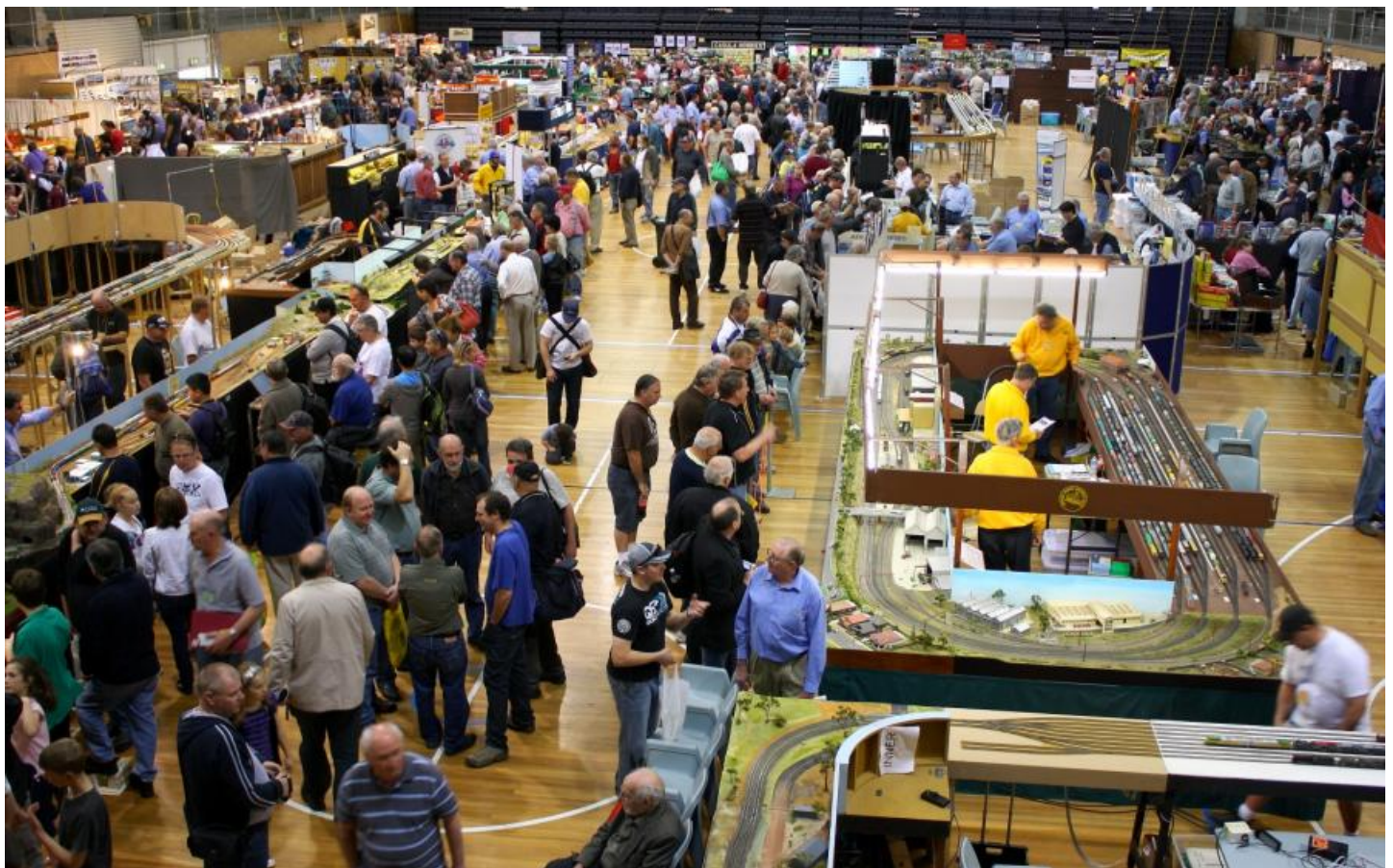
The early Saturday morning crowd viewing the exhibition.