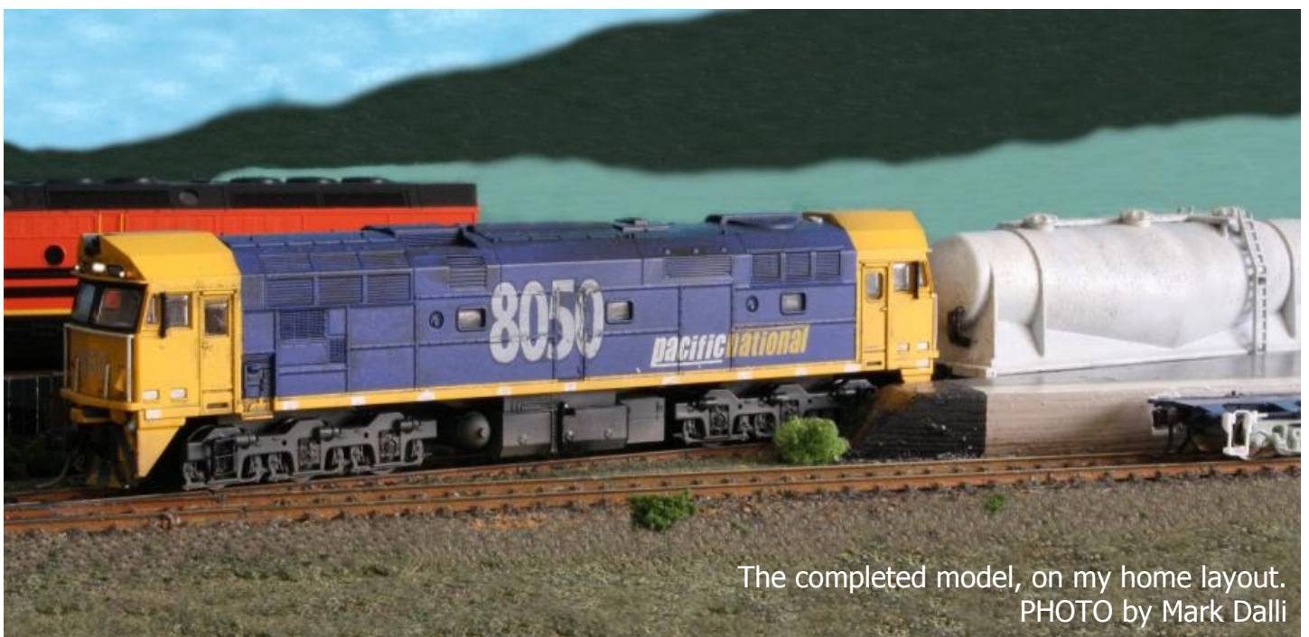
The completed model, on my home layout.