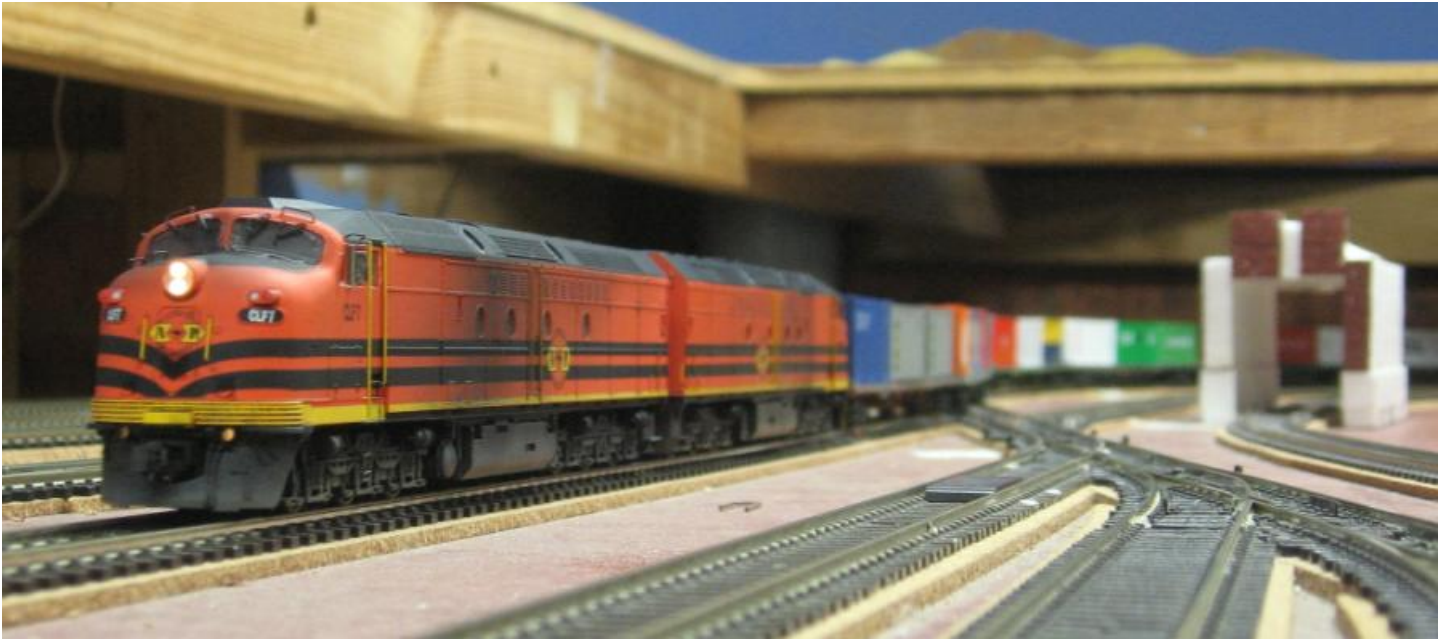
CLF7 leads a QRN intermodal container freight to a stop shy of Read platform #1.