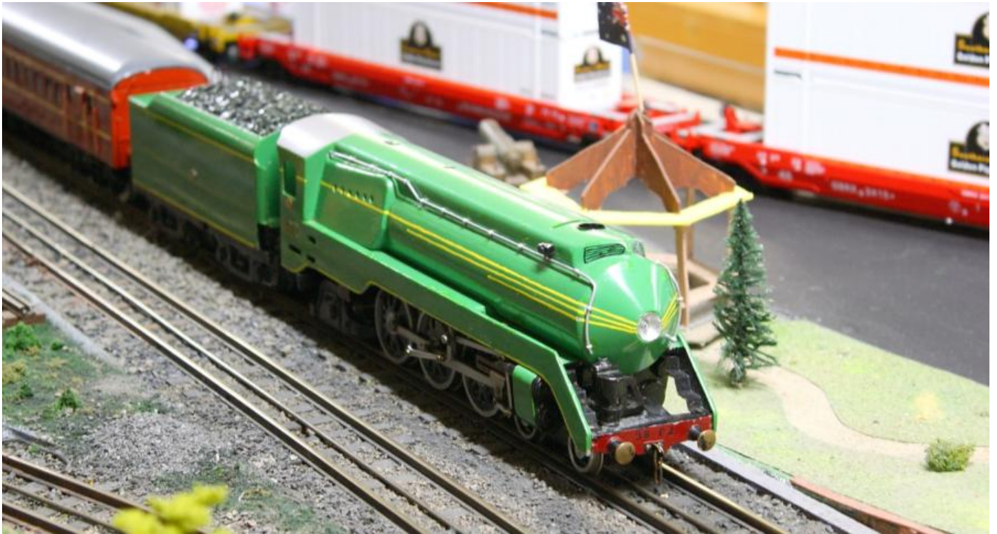
NSWGR's 3802 speeds through Hoganvale on the O scale layout.