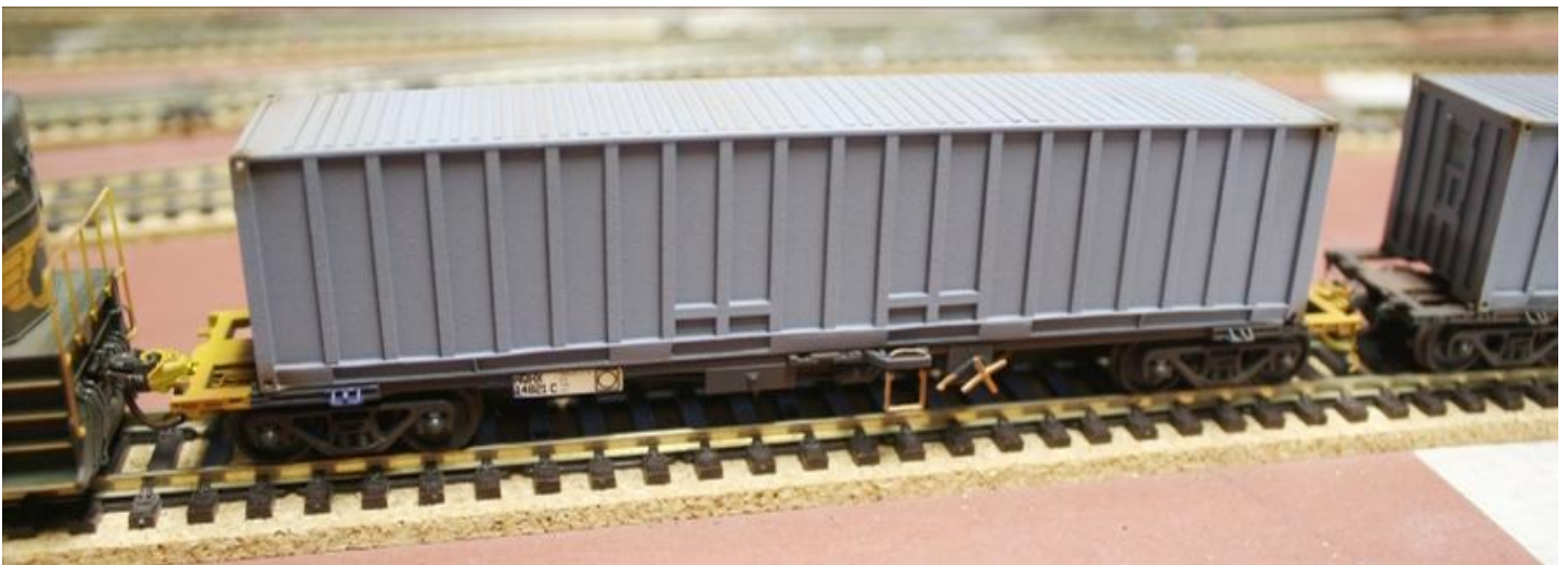
Two (2) different painted NQHX wagons one (top) in NSW/SRA Indian Red and (bottom) one in FreightCorp livery. Both wagons hold a scratch built/moulded garbage container.