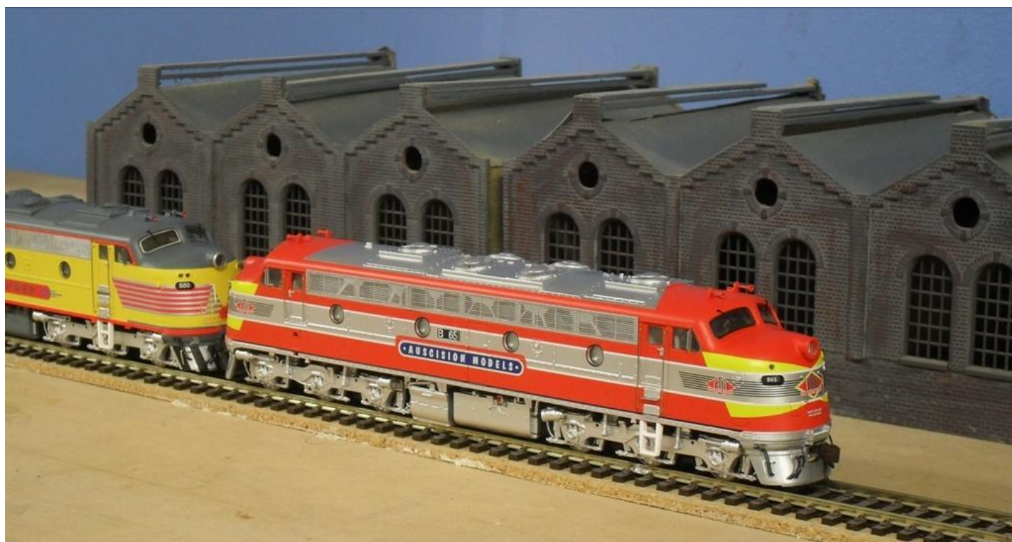
B65 in Auscision Models livery and B80 in Murraylander livery sit together in Yerriyong up yard.