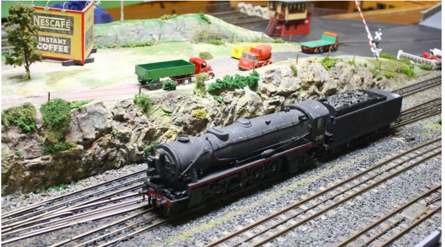
A NSWGR 57 class (5701) stands on the O scale layout (upstairs) just shy of Hoganvale station.