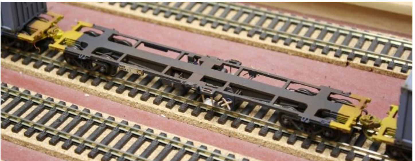
A NQHX FreightCorp wagon showing its skeletal frame.