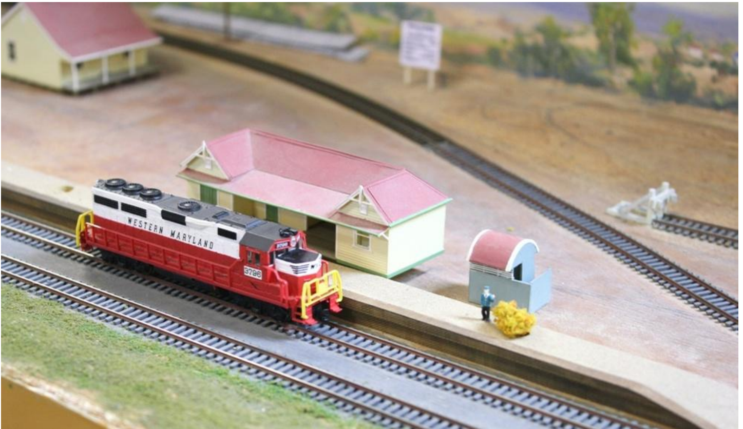
A US "Western Maryland" loco sits on the N scale layout.