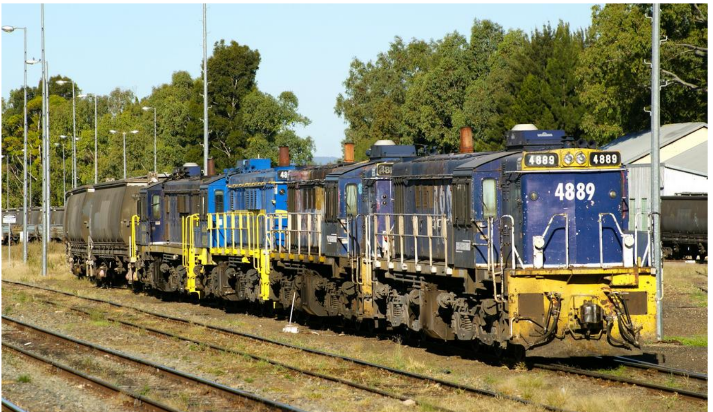
A mixed bag of 48s at Parkes NSW.