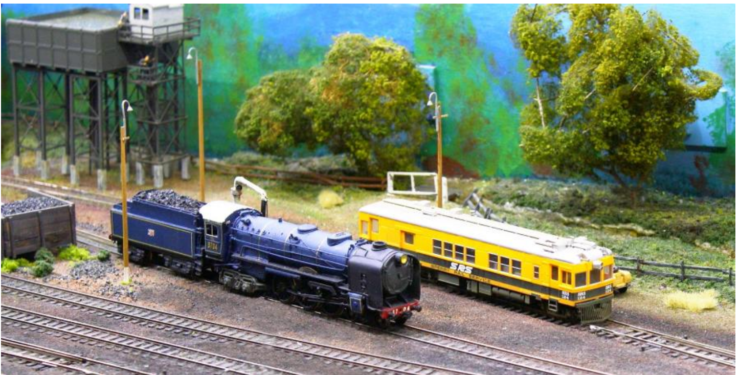
The never produced NSWGR 37 class sits on Epping Model Railway Club's layout "Brisbane Water."