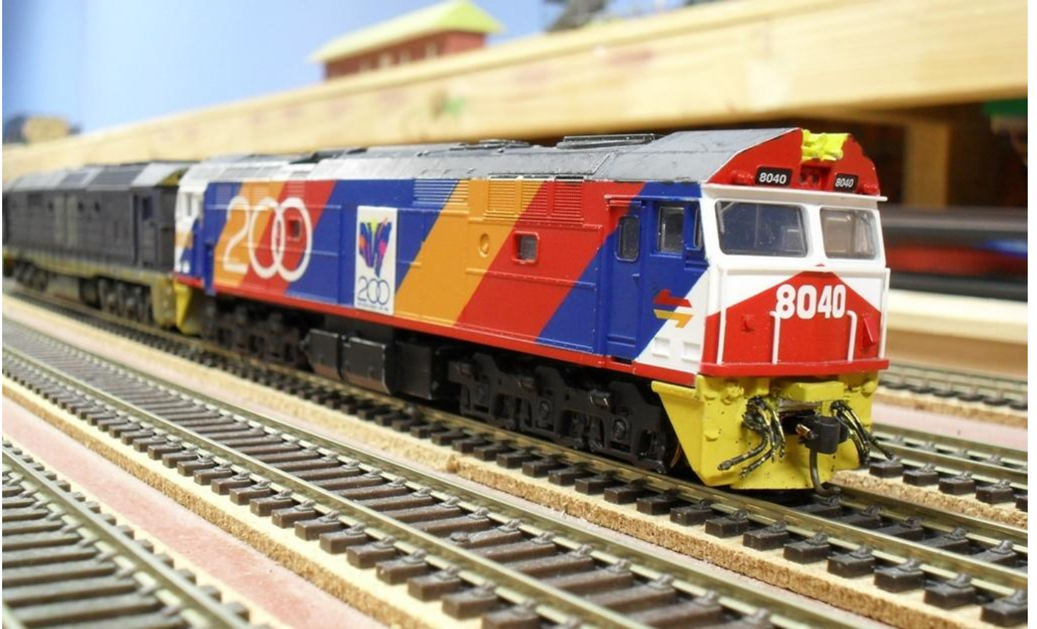
One of NSW's Bicentennial locomotives - 8040 sits on the HO layout.