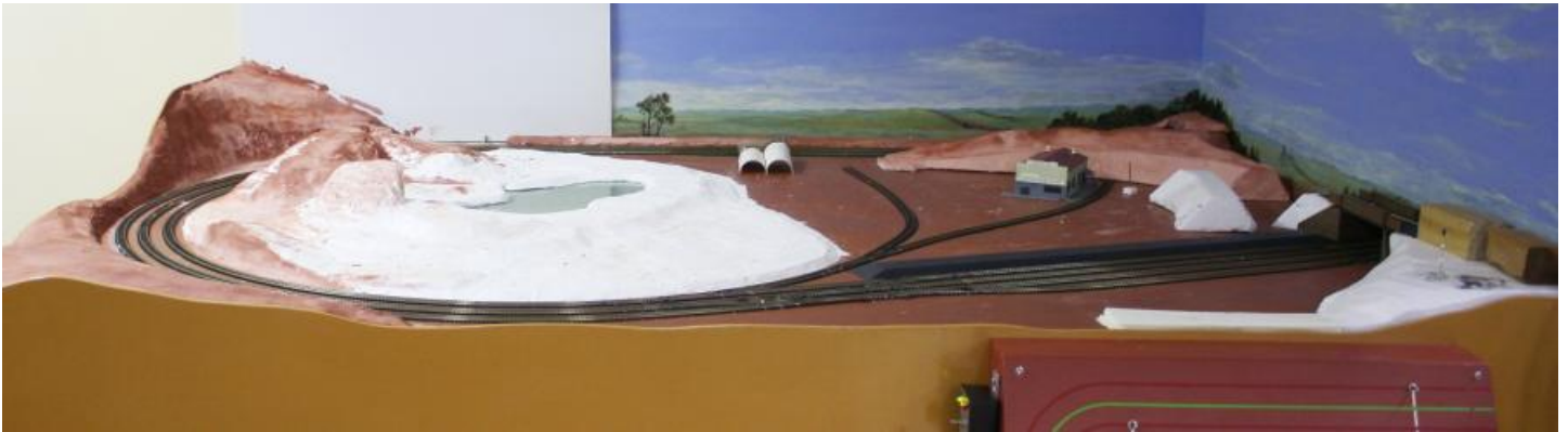
Works taking place on the N scale extension.