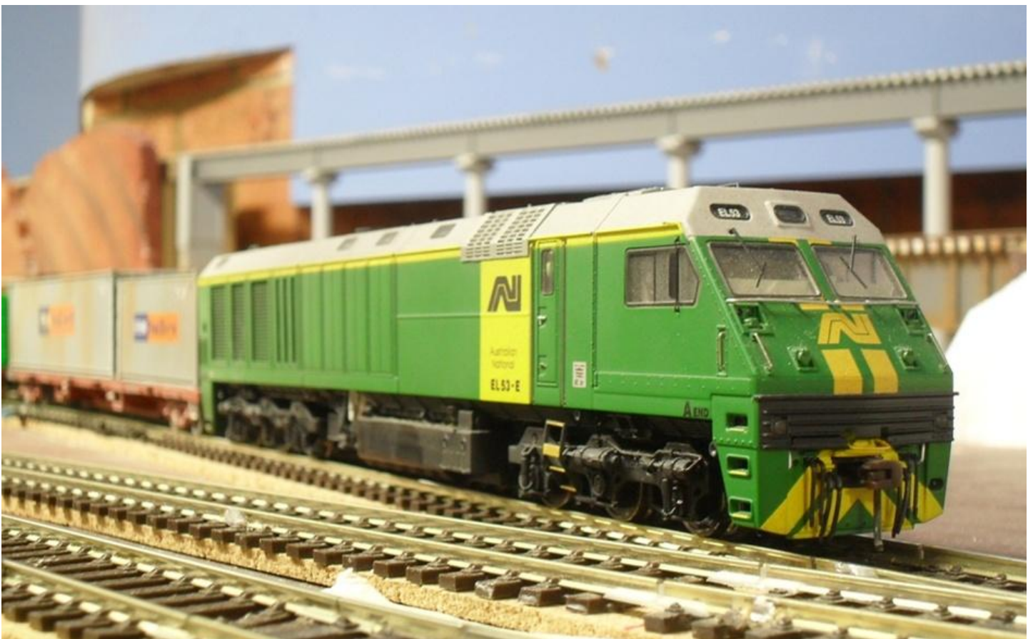
An Australian National EL class stops at DEAWY with an Intermodal freight.