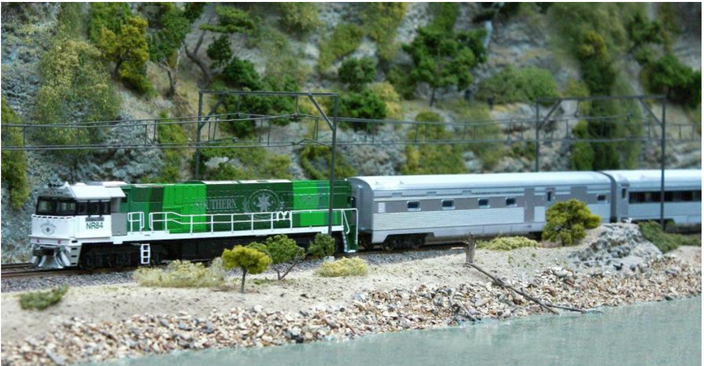
NR84 pulls the Southern Spirit through Geoff Small's layout "Mullet Creek" located near Hawkesbury River.