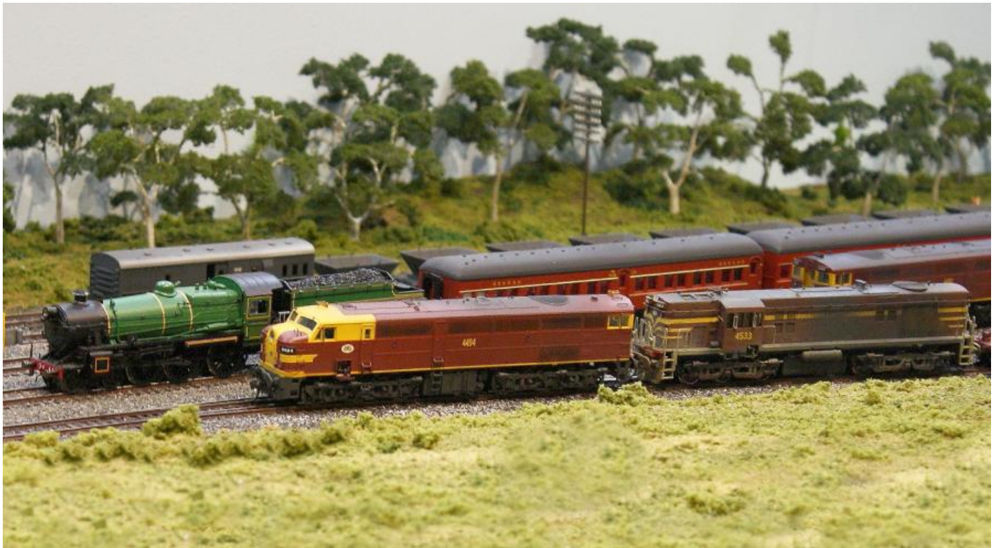
"Waterfall" by Illawarra Model Railway Association at the 48th Sydney Model Railway Exhibition.