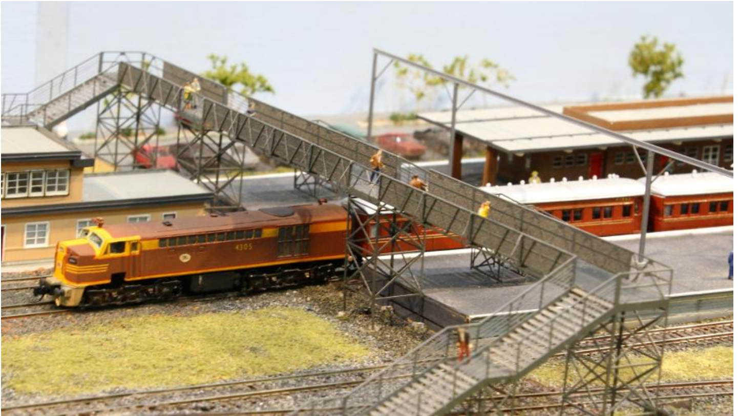
A 43 class stops at the station on the New South Wales N Scale Group's layout - "South Creek" based on Sydney outer-western suburb of St Marys.