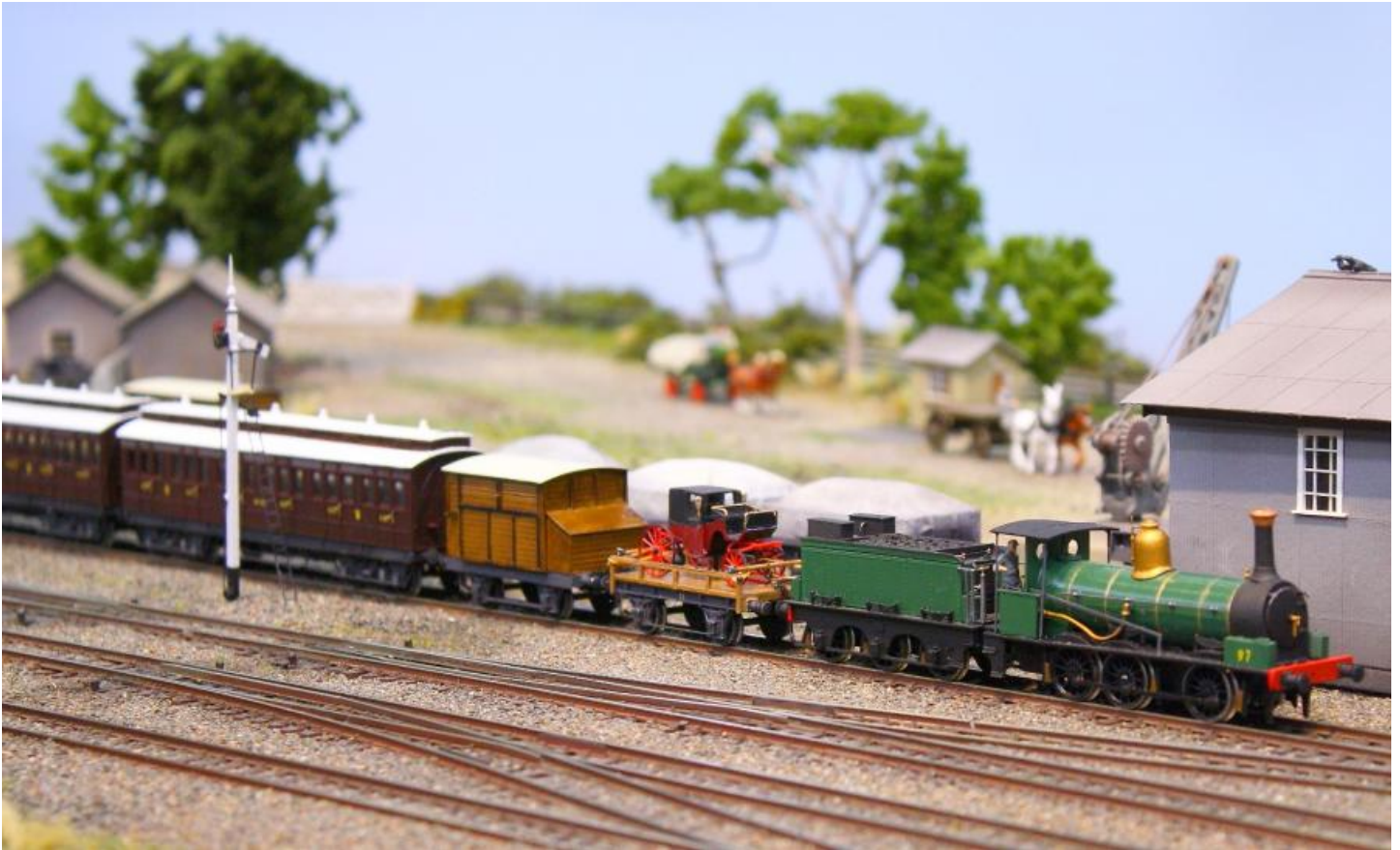
A NSWGR 97 class runs along "Eskbank" by David Low. "Eskbank" is based in the area of Lithgow NSW at the western foot of the Blue Mountains.