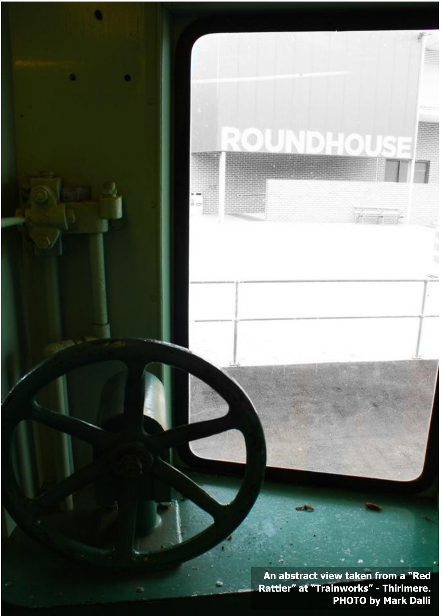
An abstract view taken from a "Red Rattler" at "Trainworks" - Thirlmere.