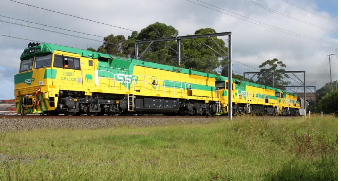
Centennial Coal's new locomotive run by SSR, the CEY class, power up at Thirroul with LS01 empty coal to Lithgow.