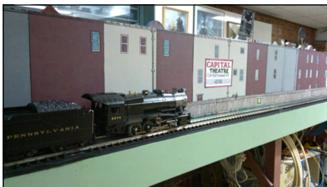
Stage 1 of the duplication runs behind the main street of Hoganvale, which required that the rear of the businesses also be modelled in low relief.

Fettlers for the new track were mainly Lance Pickering and Colin Shepherd.