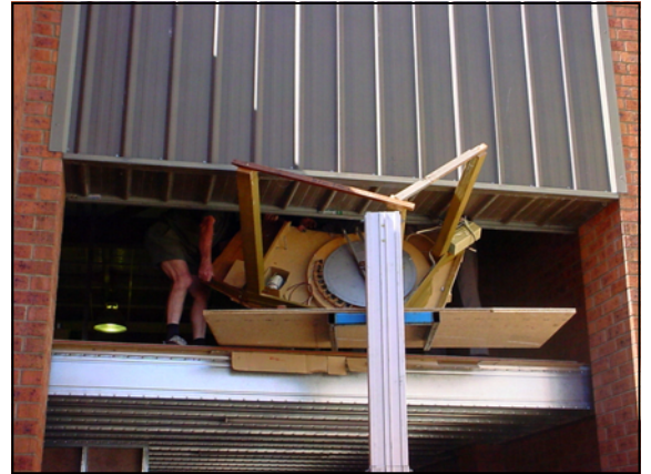
UPPER & LOWER RIGHT: The O gauge turntable is levered in; and the earliest image of a recognisable O gauge layout at Mortdale.