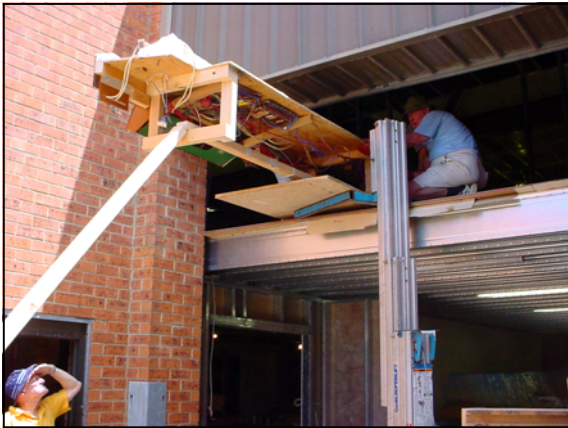
LEFT and LOWER LEFT: The N gauge layout moves in.