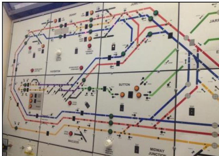
ABOVE: New tiles in place in the Control Centre.

The first Q & A (question and answer) with respect to Stoney Creek was held on 1/3/2014. Several questions were asked and answered. There will be more Q & As coming up, check the programme. As always questions will be taken from the floor, but if you have a question which you are willing to pass on beforehand, that would be great. This is so we can prepare and give the fullest answer or demonstration.