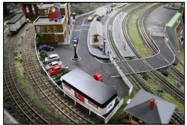
ABOVE: The end result after a revamp of the yet-to-be-named crossing. (Mark Dalli)