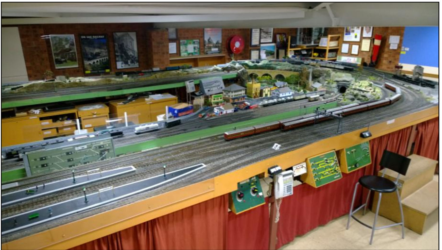
ABOVE: The O gauge layout from above, showing Davies terminus behind Central west and Shepherd's Sidings at right. (Glenn Percival)