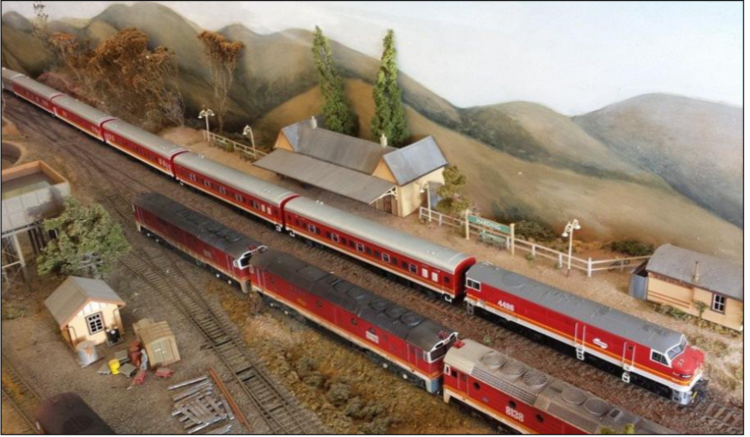
Some of Paul O'Flaherty - The Candy Man's - H0 scale 1962 Candy fleet. Most of the models captured are modified, weathered or kit-bashed. (Paul O'Flaherty)