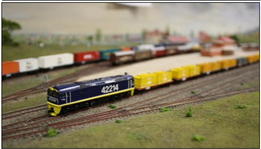
ABOVE: FreightRail 42214 waits in the loop at Bownen station with a steel train. (Mark Dalli)