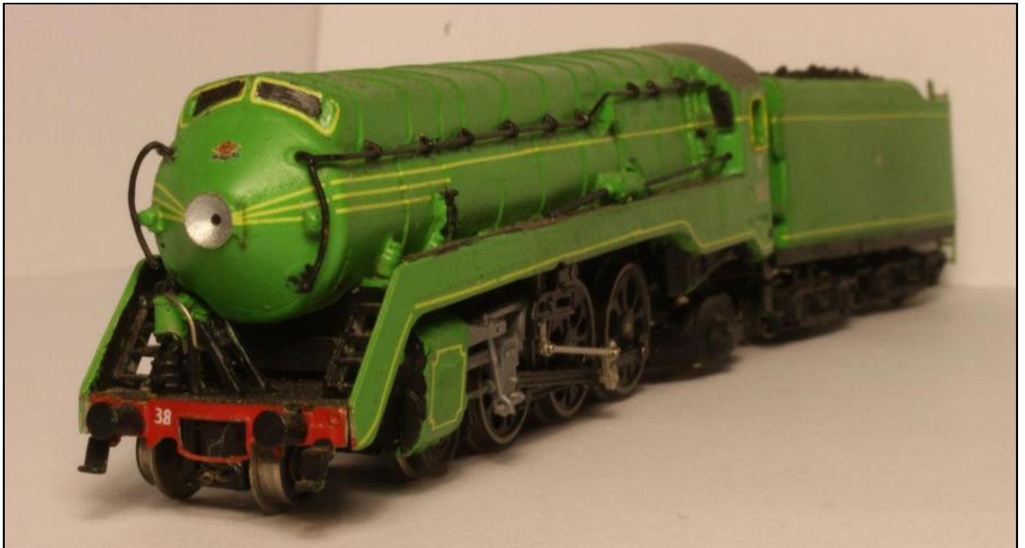
Liam Brundle's N scale C3801, a Phil Badger kit built by Liam. (Liam Brundle)