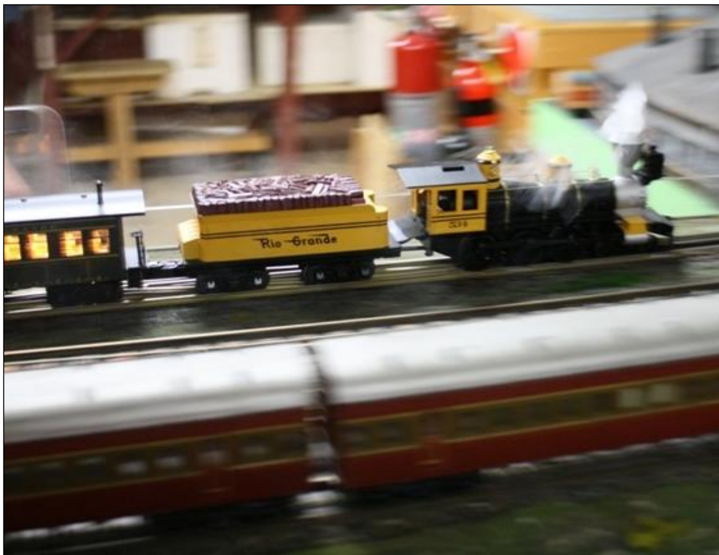
ABOVE: With the addition of DCS to the universal track on the 0 gauge in the last few years, members have been able to play with new technologies such as locomotives with sound and smoke.