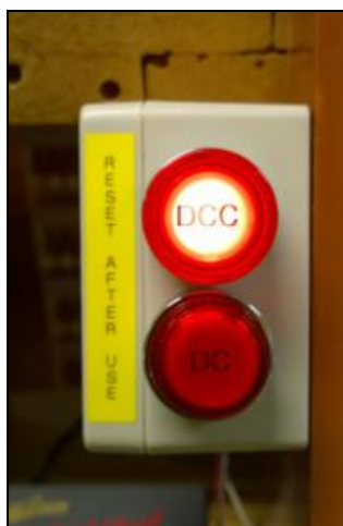
LEFT: Detail of how the traction mode will be selectable when first setting up in a yard, which will carry onto the main line when implemented. These backlit buttons are on test, with a survey on lit versus non-lit buttons running through mid-September.