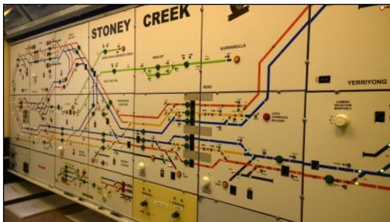
ABOVE: With all tiles wired, TV monitor selections finalised and the whole main lines visible in the CTCC, all movements into/out of yards are now controlled from here.