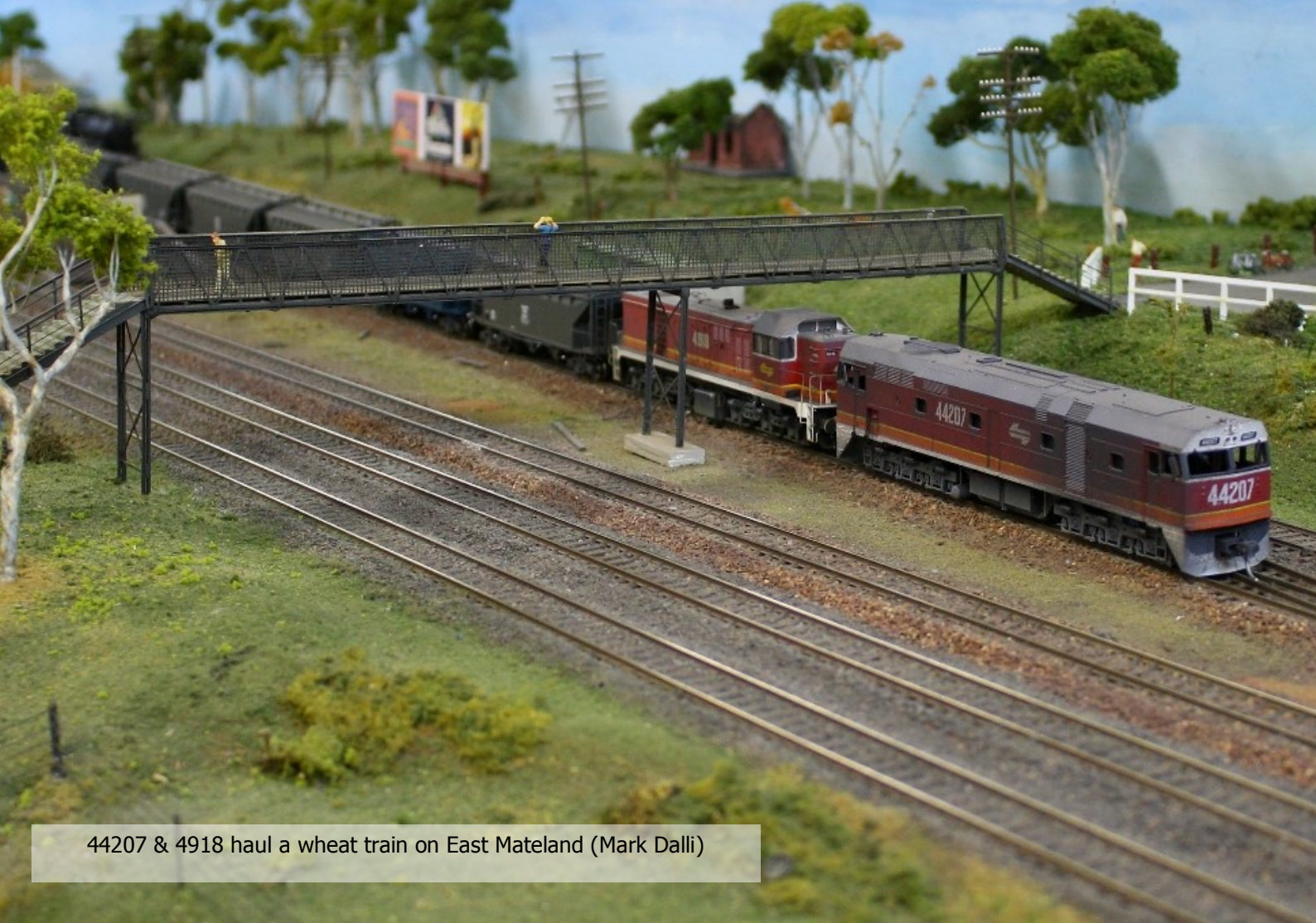
44207 & 4918 haul a wheat train on East Mateland

On a wet miserable Sunday afternoon 23rd June 2013 CEY001 in the company of FL220 & CF4401 made its way to Singleton for trials. Note the numbers on the side are actually electrical tape, to be able meet the requirement of being able to see the numbers from the track.