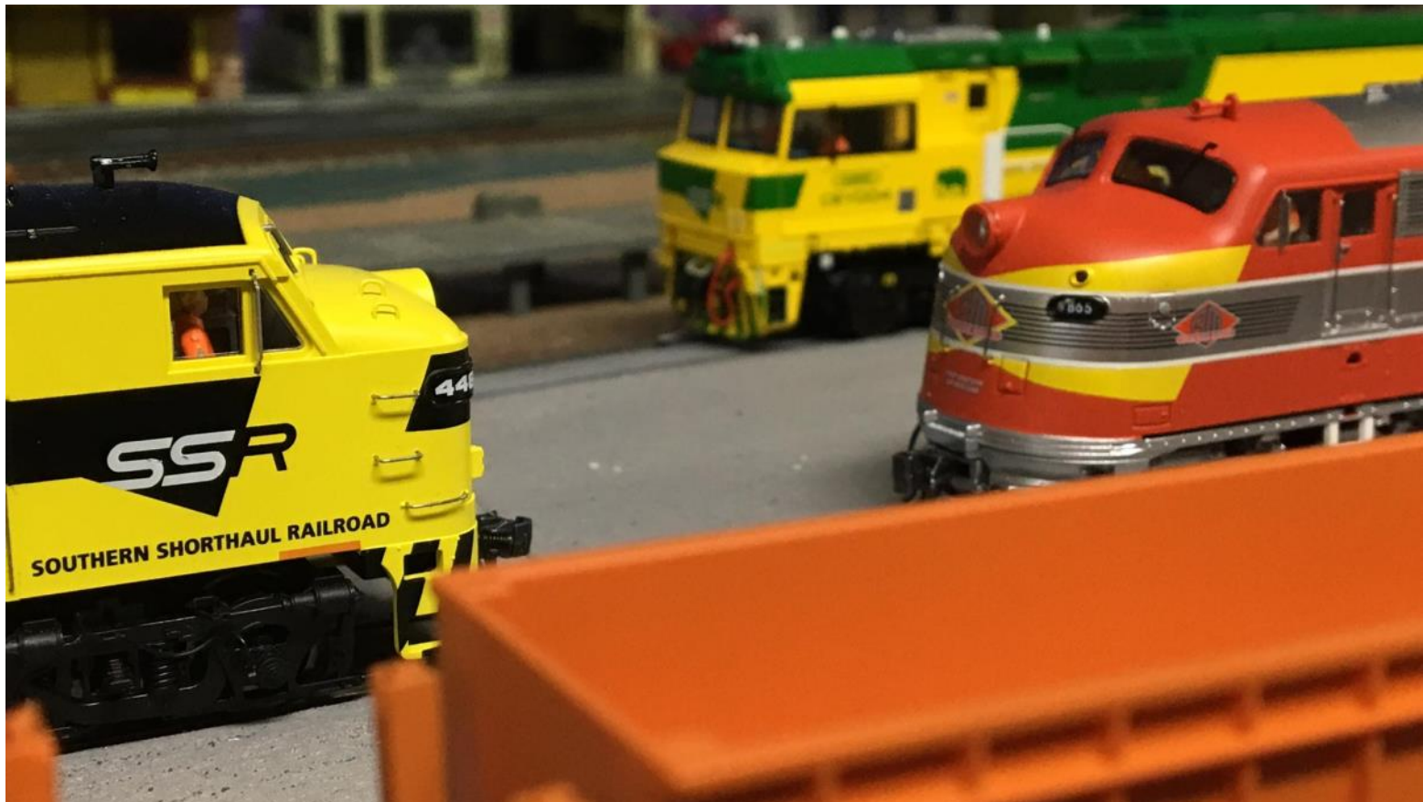
Above: A bit of a SSR invasion @ Yerriyong. ( Aaron Hobson )